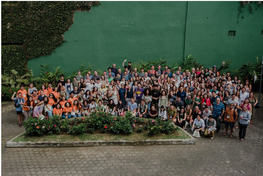
Symposium participants.