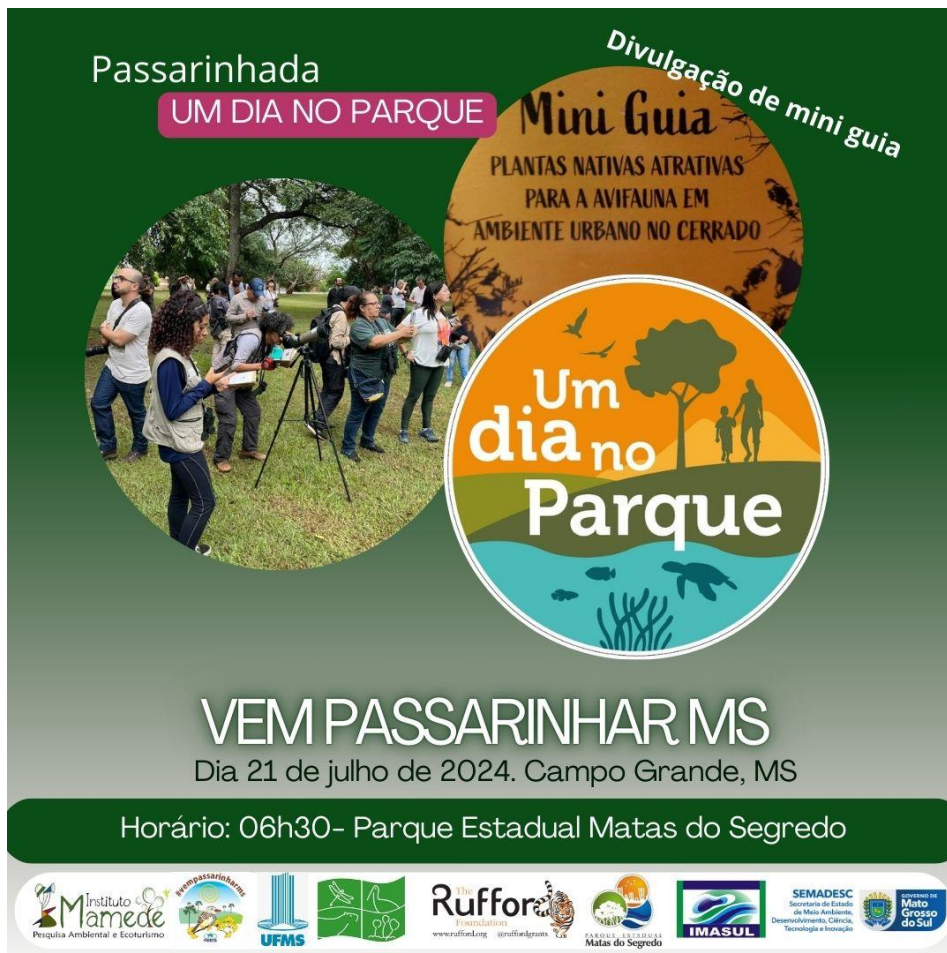
Promotional art by Instituto Mamede

The third stage of dissemination of the results occurred during the 8th Frugivores & Seed Dispersal Symposium, which brought together experts in the field of frugivory. The event was attended by researchers from all over the world in the Brazilian city of Ilhéus, Bahia. At this symposium, I presented a poster on the results obtained in this project, spoke with several researchers, and collected contacts of researchers who could assist us with statistical analyses suggested for our research. Several researchers expressed interest in our approach to disseminating the results, and we hope that the pocket guide can serve as a model to other researchers to disseminate their findings with the public. Overall, although the event sought to bring lectures and present papers on frugivory beyond tropical rainforests, I feel that frugivory in urban areas is still underexplored. There were few studies on this topic, and I hope that in the future, there will more researches focused on conserving interactions between species within urban environments.