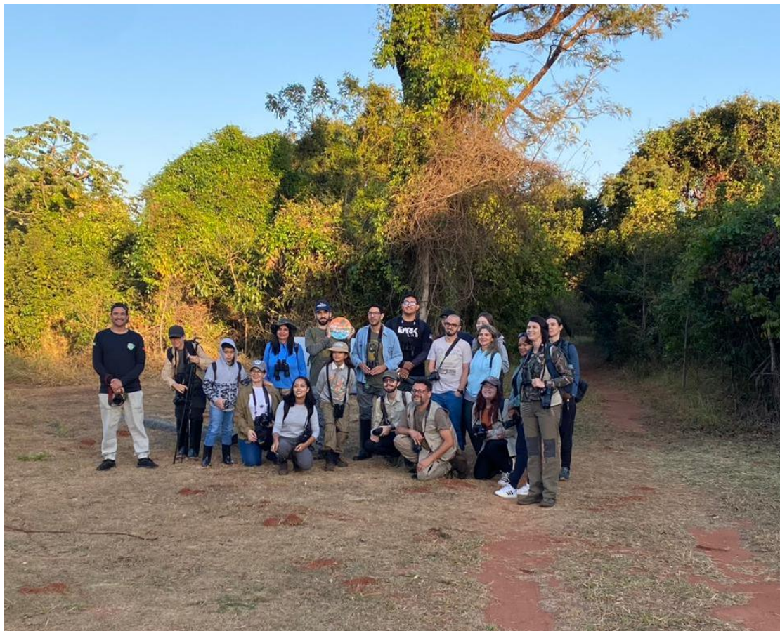
The beginning of the event.

We successfully concluded the second and third events of results' dissemination. In the second event, we distributed the pocket guide to people attending a birdwatching activity, promoted by IMASUL, the state agency responsible for the protection of conservation units in the state of Mato Grosso do Sul, Brazil. Two conservation units in the state are located within the city of Campo Grande, and were included in my project. The event took place in Parque Estadual Matas do Segredo on July 21, 2024. The event, called "A day in the park" ("Um dia no parque"), attracted more than 20 participants, and was conducted with the support of Instituto Mamede, our partner in the project.