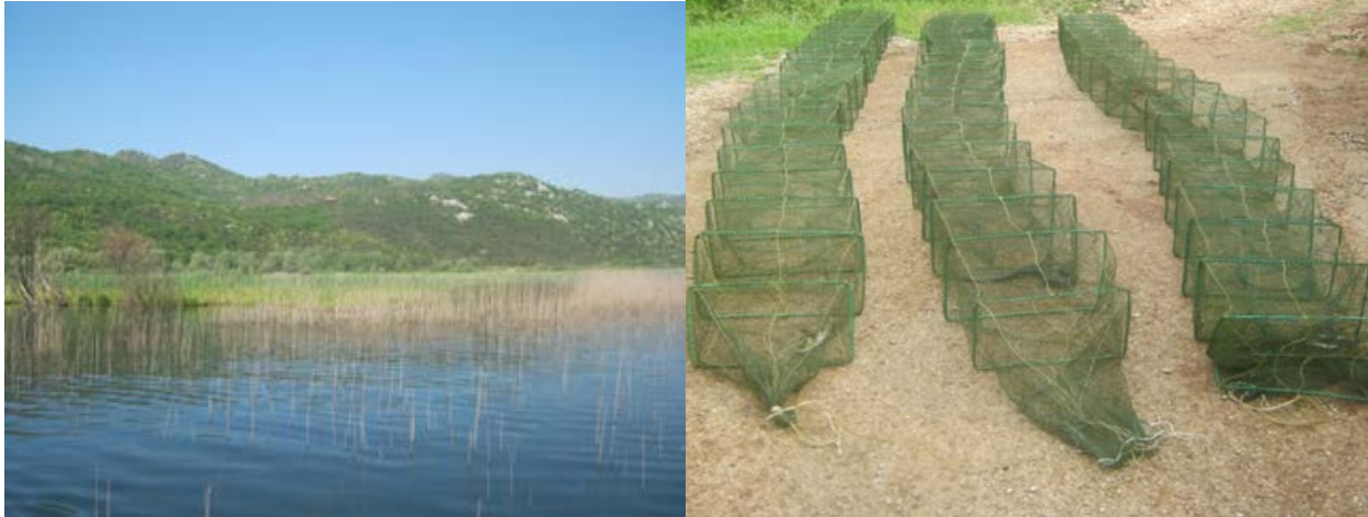
Field work area: Malo Blato – Skadar Lake

To the eel species we caught we have done the length-weight ratio and conditional factor.