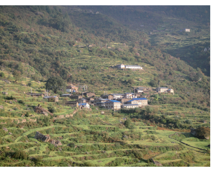
Figure 1 – Village inside Langtang National Park.

Profile Protected area Langtang National Park Mountain range Himalaya, Nepal