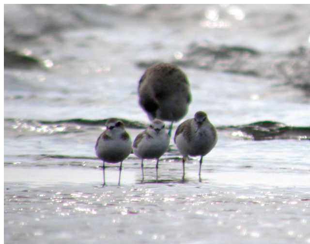
Fig. 5. A presumed juvenile White-faced Plover Charadrius dealbatus between a Kentish Plover Charadrius alexandrinus on the left and a Terek Sandpiper Xenus cinereus on the right (the bird at the back is a godwit Limosa ).

province, Indonesia (Fig. 1, 1°47'33"S, 104°32'80"E). Among them were at least six pale birds that showed the characteristics of the White-faced Plover based on criteria described by Bakewell & Kennerley (2008). Briefly these are: short breast patches, very pale ear-coverts and more extensive white on the forehead supercilium than Kentish (Figs 2–5). White-faced Plovers can appear slightly larger than Kentish Plovers though there is considerable overlap (Figs 2–5, Bakewell & Kennerley 2008). The birds appeared to be smaller than Terek Sandpipers Xenus cinereus (see Figs 3 & 5). Five of the pale plovers were presumed to be juveniles, based on conspicuous pale fringes to the mantle and scapulars, giving the upperparts a slightly scaled appearance (Fig. 2, 3 & 5). One bird was presumed to be a non-breeding female by the pale forehead and supercilium, but the upperparts look darker than the other birds (Fig. 4).