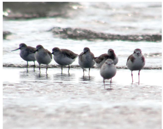
Fig. 3. A presumed juvenile White-faced Plover Charadrius dealbatus (foreground) clearly paler than five Terek Sandpipers Xenus cinereus (behind and left) and a Kentish Plover Charadrius alexandrinus (extreme right).