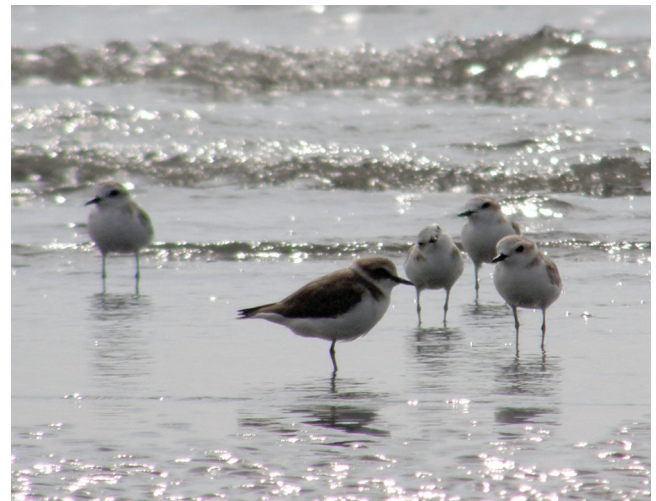
Fig. 2. Four presumed juvenile White-faced Plovers Charadrius dealbatus with a Kentish Plover Charadrius alexandrinus in the foreground.

On 16 Nov 2009, a number of plovers were observed on a sandy beach at Pulau Betet in the Sembilang National Park, Banyuasin 3 sub-district, Banyuasin District, South Sumatra