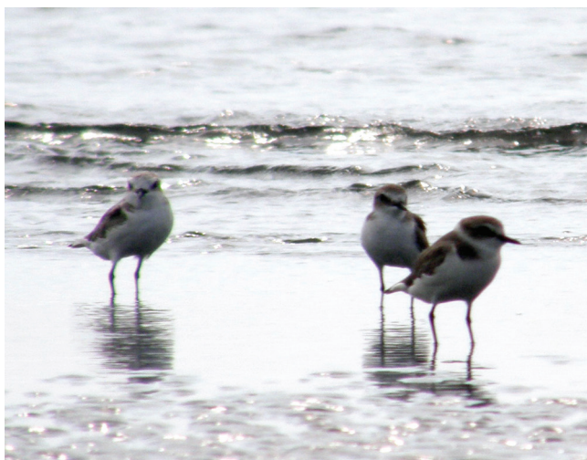
Fig. 4. Presumed female non-breeding White-faced Plover Charadrius dealbatus (left) with two Kentish Plovers Charadrius alexandrinus (right).