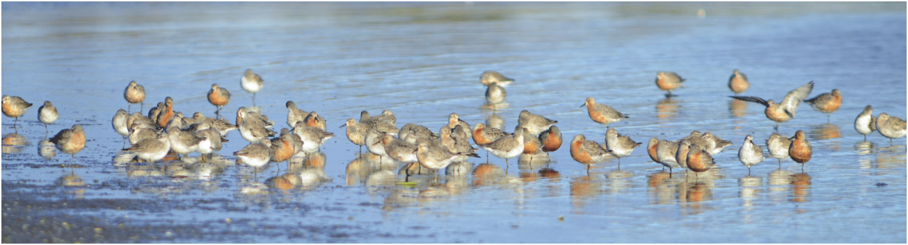
Fig. 3. Almost half the flock of over-summering Red Knots recorded at Punta Rasa during the 2013 austral winter. The photograph was taken on 22 May 2013 and shows 62 birds of which about half are in basic plumage (and therefore probably first-year birds) and the other half have advanced or complete alternate plumage indicating that they may be second-year birds or older.

We have also observed a drop in numbers of over-summering Red Knots in the Punta Rasa area during the last 30 years. This decline, however, was less pronounced than that for birds on northward migration (Fig. 2). Unlike austral autumn patterns, the proportion of individuals from the Tierra del Fuego population that use Punta Rasa during the austral winter (over-summering) seems to have remained stable during the study period. The maximum number of over-summering birds observed in the Punta Rasa area in the late 1980s and early 1990s ( n = 640 in 1987) represented about 0.95% of the non-breeding population size, whereas the maximum count of over-summering birds in the last decade ( n = 170 in 2009) accounted for approximately 0.96% of the Tierra del Fuego population estimate in 2008–2009.