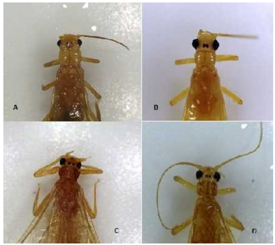
Fig. 3 Phanoperla bakeri Banks 1924 (A); Phanoperla flaveola Klapalek 1910 (B); Neoperla obliqua Banks 1913 (C); Neoperla oculata Banks 1924 (D).