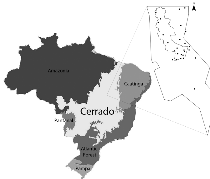
Figure 1 – Map of the study area within the Cerrado biome, in Tocantins State, central Brazil, including the limits of the Serra do Lajeado Environmental Protection Area (larger polygon delimited by the lines) and Lajeado State Park (smaller polygon), as well as the approximate location of the 27 sampling points (dots). The remaining Brazilian biomes are represented for referencing.

To test this hypothesis, we studied patterns of bat assemblage structure in Central Brazil, core region of the Cerrado biome. The Cerrado phytophysiognomies were chosen according to their representativeness in the region and included forest-like and savanna-like habitats. Within these phytophysiognomies, pristine areas, areas showing low levels of anthropogenic modification, and highly modified habitats by cultivation and/or pasture were chosen and sampled for bats during two consecutive years using a comprehensive sampling scheme of mist-netting and acoustic sampling.