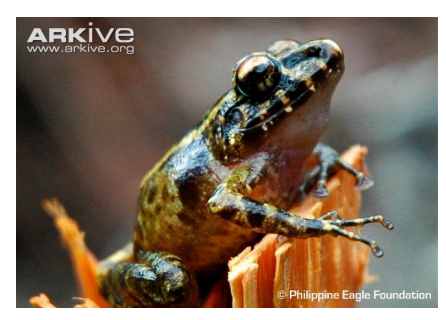
Philautus poecilus Brown & Alcala, 1994 Mindanao lesser fanged frog Endemic and Vulnerable