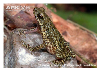
Ansonia muelleri (Boulenger, 1887) Mindanao lesser fanged frog Endemic and Vulnerable

Mount Hamiguitan Range Wildlife Sanctuary (MHRWS) is one of the only two highly distinguished UNESCO and ASEAN heritage sites in the Philippines. It provides a haven to globally threatened and endemic flora and fauna species, of which eight are found nowhere else except in Mount Hamiguitan. These include critically endangered trees, plants and the iconic Philippine Eagle and Philippine Cockatoo. MHRWS lies in the southernmost part of the Philippines in the province of Davao Oriental in Mindanao and straddles two municipalities and one city namely Governor Generoso, San Isidro and Mati City. It has an altitude of 75 to 1,637 masl and contains highly unique geological and biological features. It is the only protected forest noted for having the largest and most unique pygmy or bonsai forest with century old trees thriving in a highly basic ultramafic soil. MHRWS belongs to the Philippine Biogeographic Zone 14 known to have the highest land based biological diversity per unit area. It was declared a UNESCO World Heritage Site on June 23, 2014 and has been officially declared as the 34th ASEAN Heritage Park on October 30-31, 2014. Truly it is a pride not only of Davao Oriental but of the Philippines.