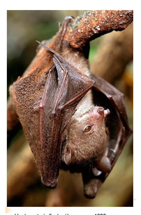
Haplonycteris fischeri Lawrence, 1939 Philippine pygmy fruit bat Endemic and Vulnerable