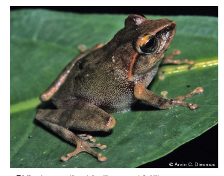
Philautus acutirostris (Peters, 1867) Point snouted bush frog Endemic and Vulnerable