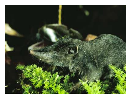
Crocidura beatus Miller, 1910 Common Mindanao shrew Endemic and Vulnerable