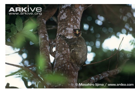
Cynocephalus volans (Linnaeus, 1758) Flying lemur Endemic and Vulnerable