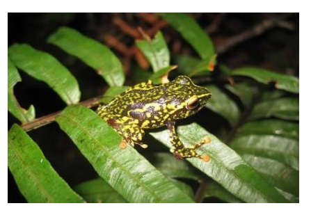
Philautus poecilus Brown & Alcala, 1994 Mindanao lesser fanged frog