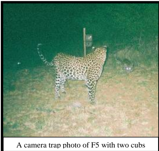
A camera trap photo of F5 with two cubs

The darting procedure went well, and we found that Johan is in better condition than ever. He weighed in at a hefty (for the Cape) 48kg. After a very efficient swap of the collars we hurried to a cliff above to watch the impressive Johan awake as good as new, although possibly with a slight hang over.