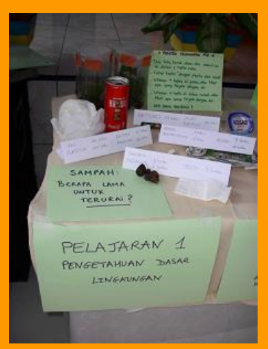
Display on waste treatment for the teacher training