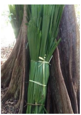
Woka illegally logged

In the Tangkoko forest, MNP researchers also witnessed illegal logging, especially concerning the wood Bugis Hutan, used for cooking and house building. Woka leaves have also been chopped off, probably for to be used as roofing material.