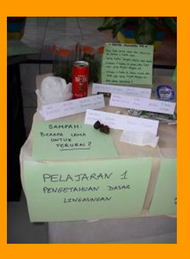
Practical display about waste (Lesson 1)