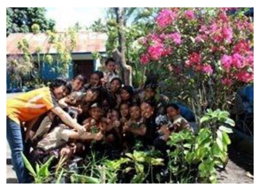
Pupils at Sagerat, planting trees in the school yard

Teachers from the class 5 at Sagerat primary school are deeply committed to environmental protection and we are delighted to see how they are bringing awareness to their pupils.