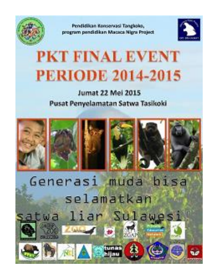
Announcement poster of this end of year event