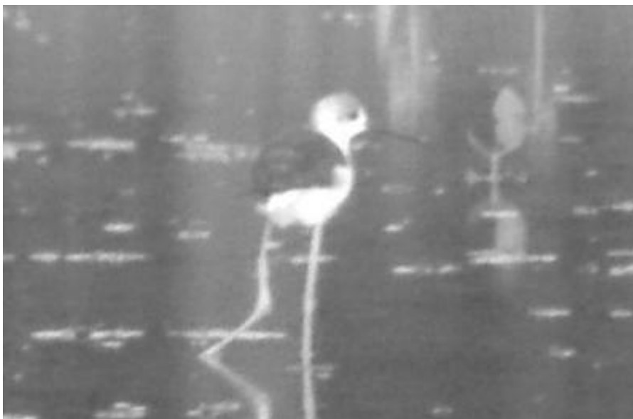
Figure 2. Single juvenile White-headed Stilt at the Pasir River on 8 March 2008.

Ogan Komering Lebak. In addition, local people in Pasir River and Sugihan bay reported that White-headed Stilt usually breed all over the year depend on water level conditions around fishpond in the area. Sightings of Whiteheaded Stilt during 2008 outside floodplain of Ogan Komering Lebak support Parrot and Andrew (1996) hypothesis on resident status of White-headed Stilt in Sumatra based on seasonal