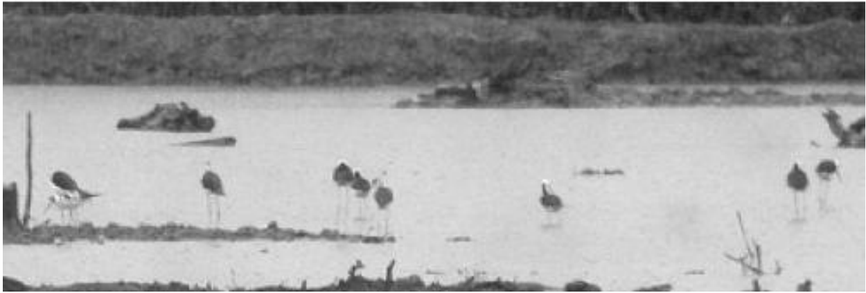
Figure 3. Adults and juveniles of White-headed stilt in Sugihan bay on 11 July 2008.

summer visitors”, from Australia or else “accidental visitors” from West Java where it breeds. On the basis available data, it is suspected that most White-headed Stilt move to the floodplain of Ogan Komering Lebak during dry season for feeding and breeding. When rainy season, they move along the east coastal of Southern Sumatra between Lampung and South Sumatra province. Productive pairs also used fishponds as breeding ground around the east coast when the pool drying. Based on these reasons, it is concluded that recent status of White-headed Stilt is resident in Sumatra. This resident population possible come from small visitor population from Australian or West Java where it previously breed.