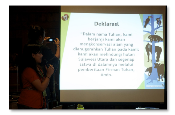
In the name of God, we promise to conserve the nature; to protect the forest and the Wildlife..

As another part of our "two step approach" (capacity building), we organized a series of workshops in each campaign area, called "Torang Bacirita ("we Discuss"): Green Gospel" that brings together the leaders from the biggest churches in North Sulawesi. The fact that yaki