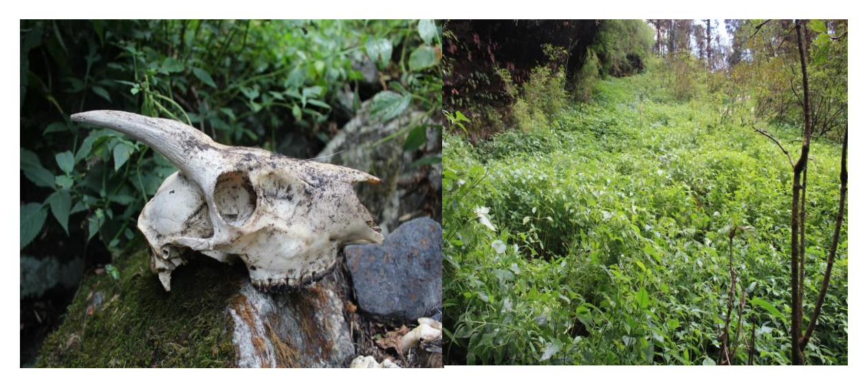
Photos of a skeleton (skull in picture) of a deceased serow on the 26<sup>th</sup> of September 2016, found along the main stream of the Shokarkh valley. Seen on the right is the vegetation adjacent to the skeleton. Notice the lack of trapping or other predation related evidences.

Additionally, a skeleton of a Serow was found in the Shokarkh valley, at an elevation of about 3074m. The skeleton seemed at least a month old, upon its discovery on the 26<sup>th</sup> of September 2016, as the decaying smell wasn't very pungent, all the meat was entirely either eaten or had decayed, and the bones had lick marks on them. Additionally, there seemed to be no sign of predation around the skeleton such as sprint marks, trampled vegetation or blood stains. Had this been a predated kill, we should have expected to see trampled vegetation, as adjacent to the skeleton, the ground was covered primarily with soft stemmed and large leaved plants that were