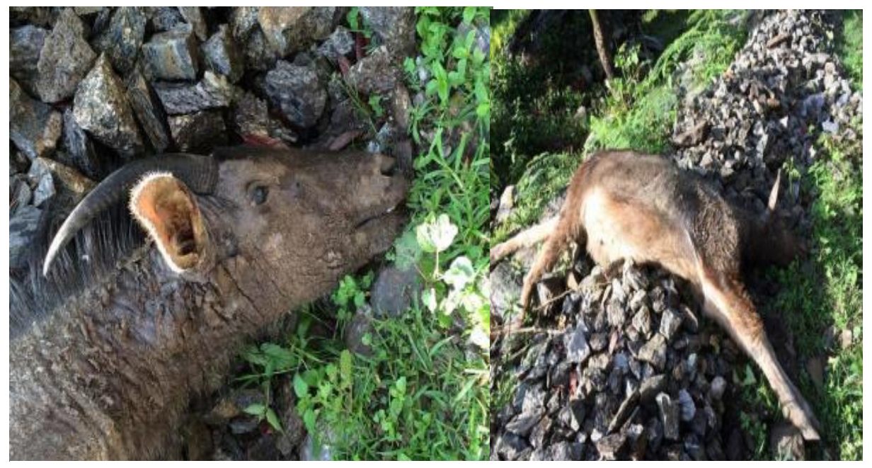
Photos of a freshly deceased Himalayan Serow from the 29<sup>th</sup> of June 2016 at 0653 hours, found near the Siroli village. Seen clearly on the skin is evidence of sarcoptic mange disease, characterized by hair loss, due to drying and scratching of skin.

In Siroli, a male serow was seen falling off a rock cliff onto the ground below, where it was found dead. It was unclear if the individual died due to the fall or before. No sign of bleeding, bruising or predation were seen. The individual had marked alopecia and severe lesions, which were confirmed by the veterinarian to be hyperkeratoic and parakeratoic. This is indicative of a lack of a hypersensitive response due to anergia or malnourishment (Arlian, 1989; Arlian et al. , 1994), thus an indication of a severe case of sarcoptic mange. The case was confirmed to be sarcoptic mange, upon examining of deep skin scrapings in 10% potassium hydroxide (KOH), identified by idiosomal denticles and club-shaped setae, by a professional veterinarian (Pence et al. , 1975). This site is located at an elevation of