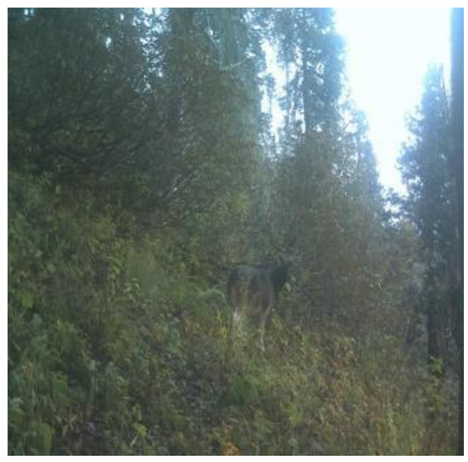
Himalayan Serow caught foraging on a camera traps placed in the Kedarnath Wildlife Sanctuary. This area had been previously visited by a large herd (~700) of livestock.

Sarcoptic mange has been recorded in different Himalayan mammals, especially ungulates (Aziz et al. 2003; Hameed et al., 2016). In fact, it is a very wide ranging epizootoic disease occurring in 10 orders, 27 families and 104 species of domestic and free-ranging/wild animals (Pence & Ueckermann 2002). Generally cases aren't severe, but examples such as the complete wiping out of Red fox, Vulpes on Borrnhold Island in Denmark due to this disease, highlights its potential severity in isolated and fragmented populations (Henriksen et al., 1993). This disease has been documented to be one of the major causes of death and population decline in Southern Europe for Chamois, Rupicarpa lbex, rupicarpa and Iberian Capra pyrenaica, species that are ecologically