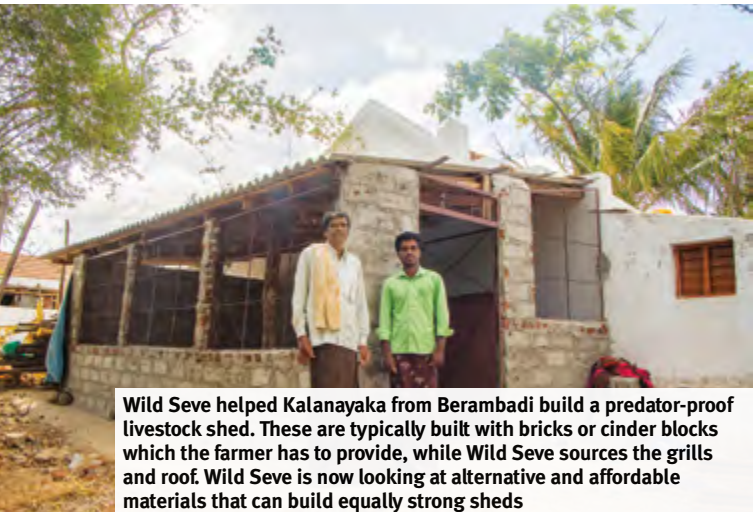
Wild Seve helped Kalanayaka from Berambadi build a predator-proof livestock shed. These are typically built with bricks or cinder blocks which the farmer has to provide, while Wild Seve sources the grills and roof. Wild Seve is now looking at alternative and affordable materials that can build equally strong sheds