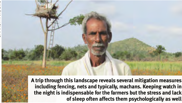
A trip through this landscape reveals several mitigation measures including fencing, nets and typically, machans. Keeping watch in the night is indispensable for the farmers but the stress and lack of sleep often affects them psychologically as well