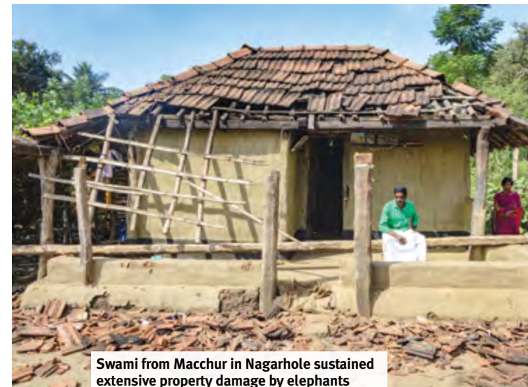
Swami from Macchur in Nagarhole sustained extensive property damage by elephants

For more details, contact wildseveindia@gmail.com