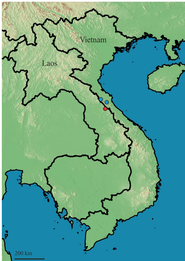
Fig. 1. Map showing the distribution of Gracixalus quyeti , including the localities of the type series after Nguyen et al. (2008) in Quang Binh Province, Vietnam (marked with blue dots) and our first record from Khammouane Province, Laos (marked with a red dot).