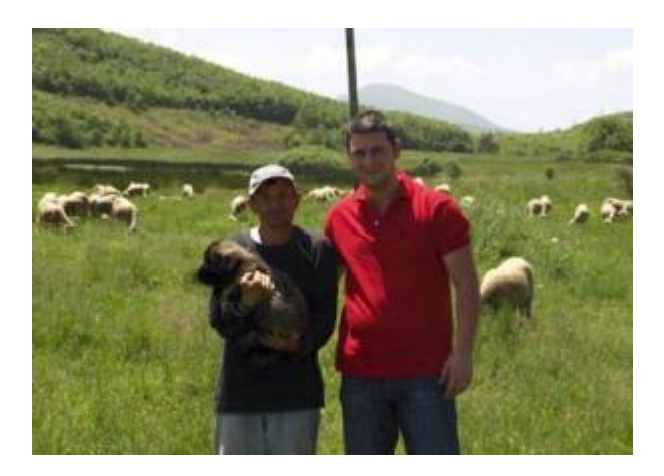
Donating a puppy to a shepherd in Rrajca (Albania)

After two months of very cold winter in Albania, the project Shara mountain dog continued to be implemented with field activities such as meetings with shepherds of Qarrishta and Rajca villages, participation on Royal Canine dog's competition, Shara mountain dogs distribution, network building between shepherds and farmers, training in dog maintenance, institutional lobbing between countries etc.