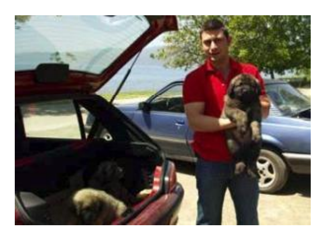
Transporting three puppies from Struga (Macedonia)