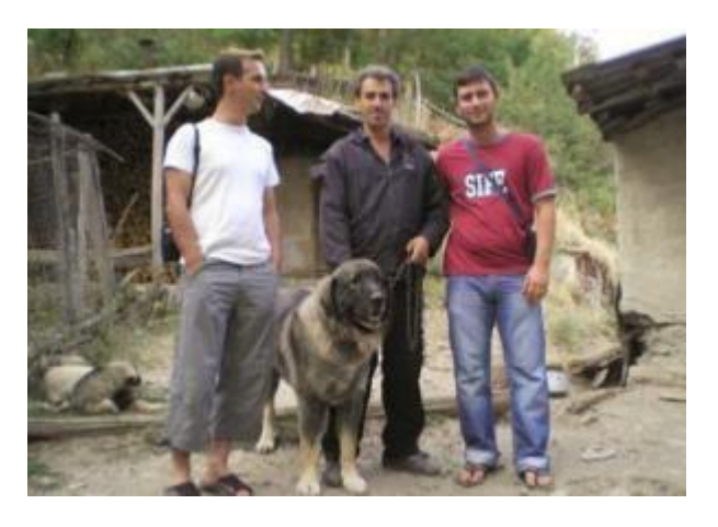
One of the best (most traditional) farmer in Balkans