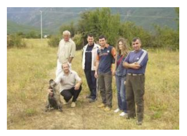
Searching for pure breed