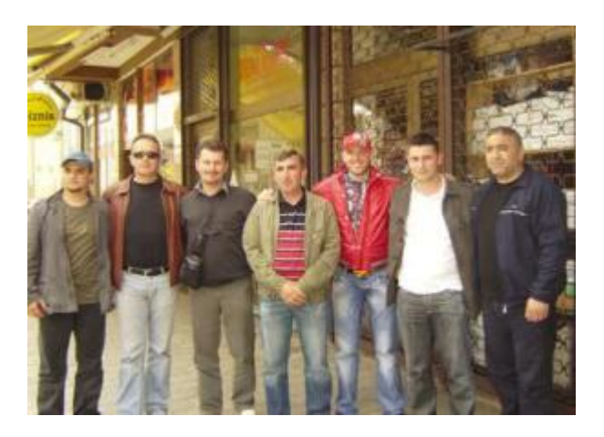
Dog breeders from Kosovo, Albania and Macedonia