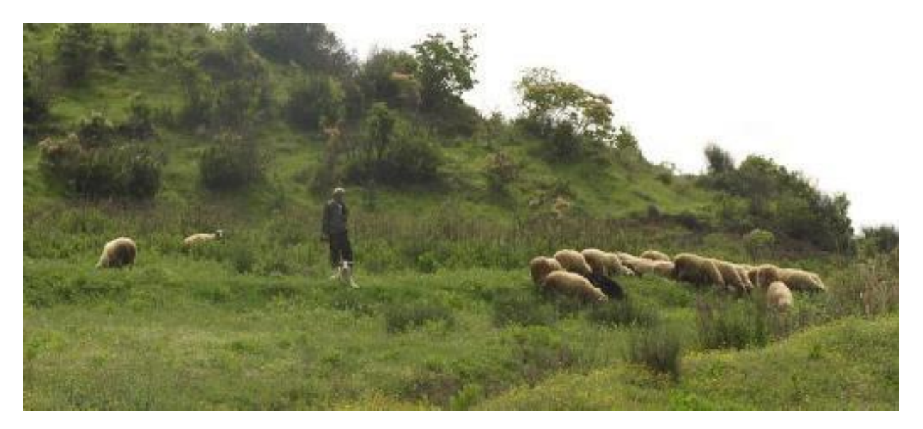
Albanian traditional herding livestock

Note: The population of Qarrishta village is composed by two main family-tribes: Hasa and Bicoku. They are living mainly with livestock breeding (husbandry).