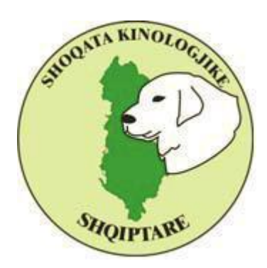
Albanian Kennel Association Rr. Komuna e Parisit, Tirana, Albania