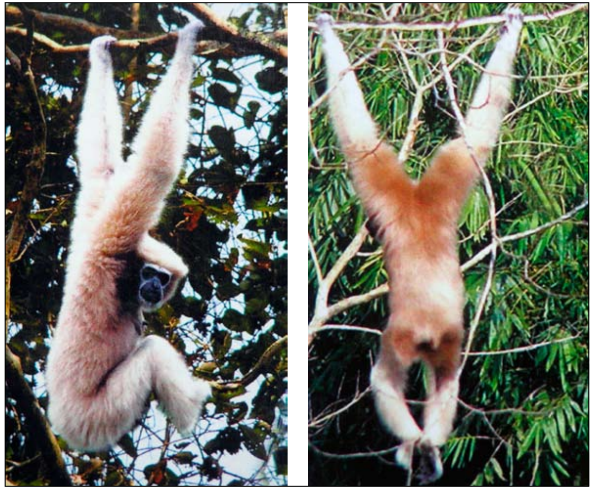
Figure 3. Adult female eastern hoolock gibbon (Hoolock leuconedys).