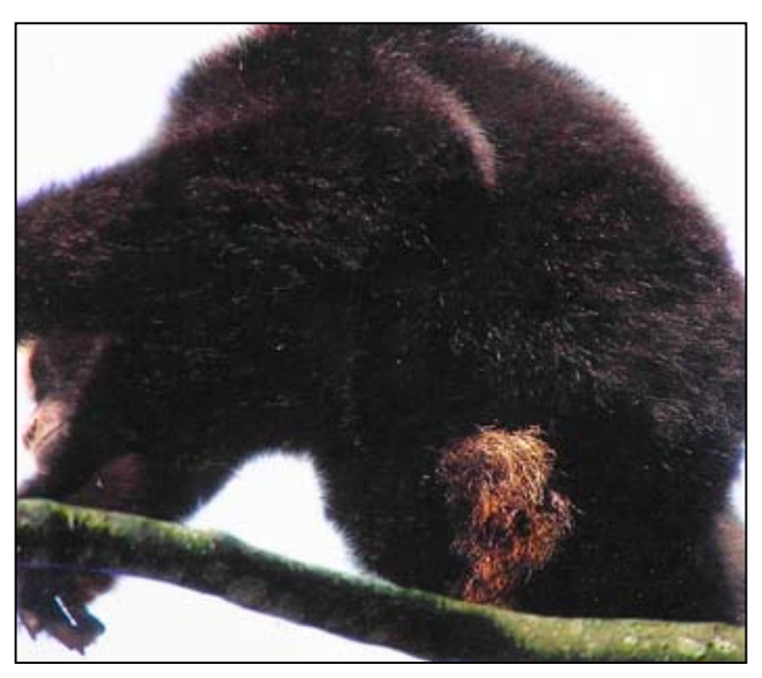
Figure 2. Adult male eastern hoolock gibbon ( Hoolock leuconedys ) showing the genital tuft.

This range extension lies between the rivers Dibang and Lohit. Although further, more detailed, studies are needed, it is evident that forest loss and fragmentation due to expansion of tea gardens, ginger and mustard cultivation, horticulture, jhum cultivation, and rice paddies is a major threat to the species in this area. In 2007, a team of forest officers of the Arunachal Pradesh government, under the supervision of Mr. C. Loma of the Deputy Conservator of Forests (DCA) (Director, Biological Park, Itanagar), rescued 12 individuals of eastern hoolock gibbon (in four groups) from the Dello village in the Koronu Circle area in the Lower Dibang valley district. The gibbons had been trapped in a very small remnant forest with very few trees left standing. The rescued gibbons are now in the Zoological Park at Itanagar, the capital of Arunachal Pradesh. The Koronu Circle area on the fringe of the Mehao Wildlife Sanctuary and Turung Reserve Forest