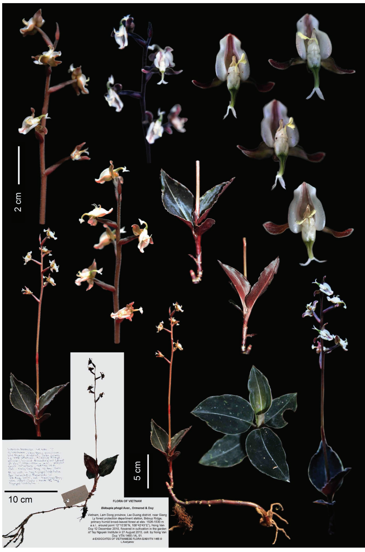
FIGURE 2. Bidoupia phongii . Digital epitype, EXSICCATES OF VIETNAMESE FLORA 0249/VTN 1465/AL 91. Photos by Nong Van Duy, design and image correction by L. Averyanov.