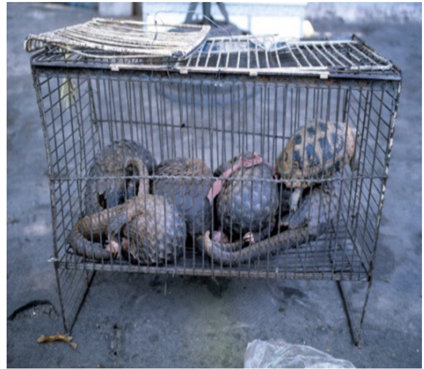
Imprisoned pangolins for sales