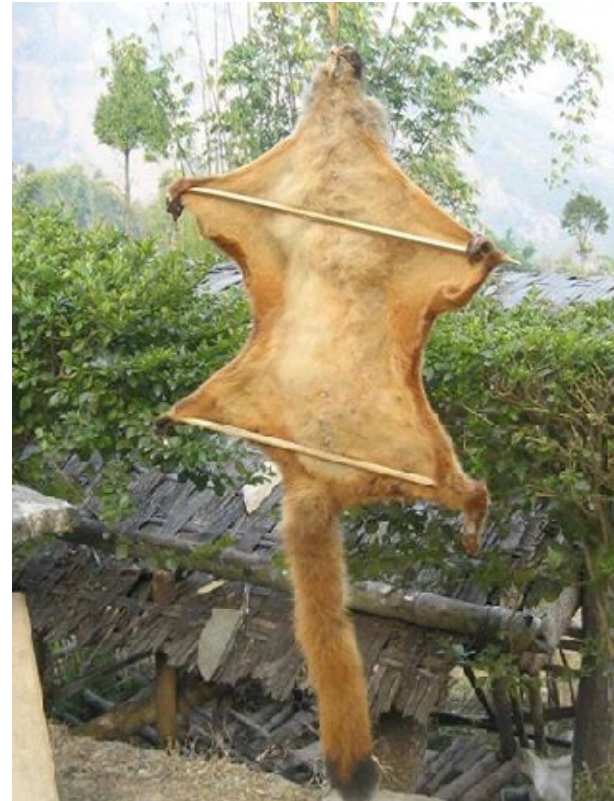
Pangolin killed by locals at Taplejung.