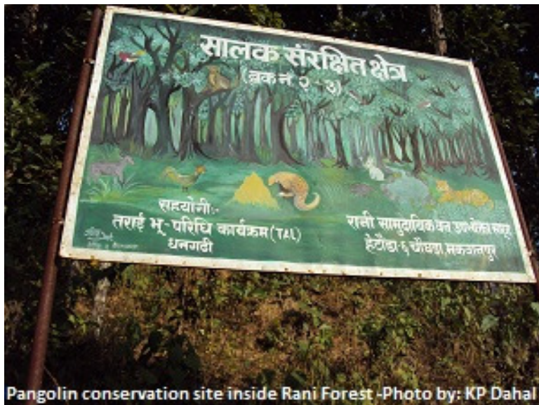
Pangolin conservation site inside Rani Forest

Pangolin conservation site inside Rani forest