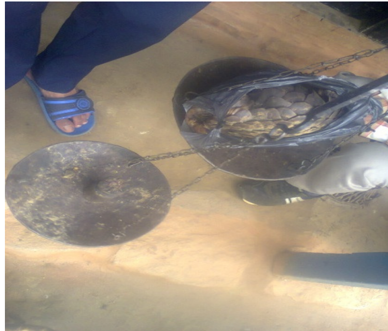
DFO Bhojpur weighing pangolin's scale.