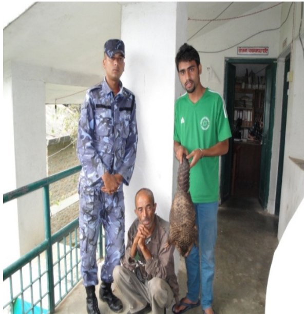
Local busted red hand by hunter sl police at Bhojpur. Nepal