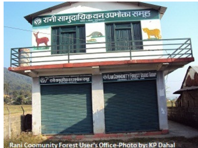
Rani Community Forest User's Office

Pangolin conservation site inside Rani forest