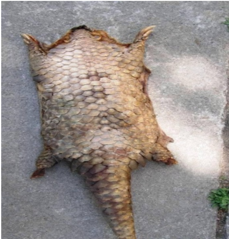
Pangolin's scale at Dhankuta Nepal.