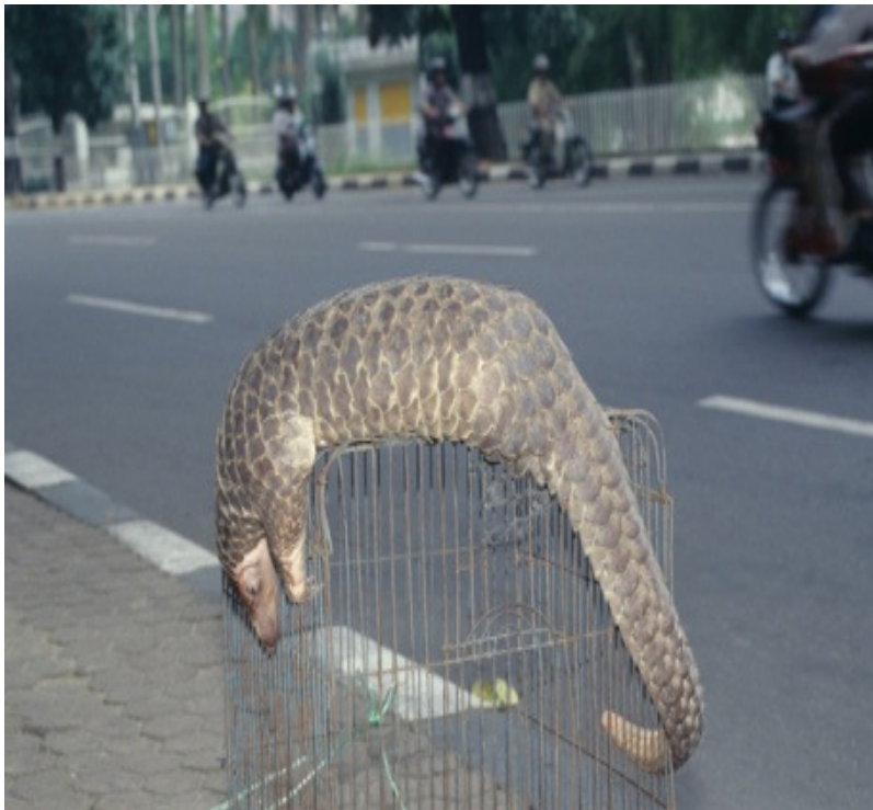
Pangolin for sales: TRAFFIC