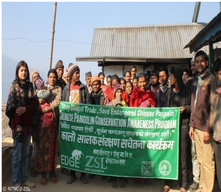
Community-meeting-at- Boharadin-of- Nangkholyang-village