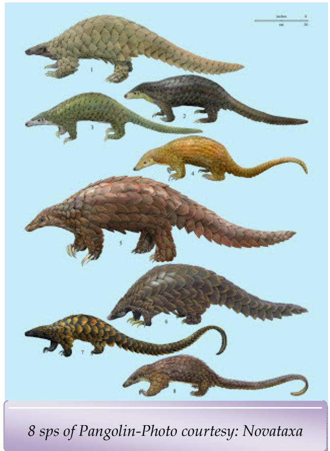
8 sps of Pangolin-Photo courtesy: Novataxa