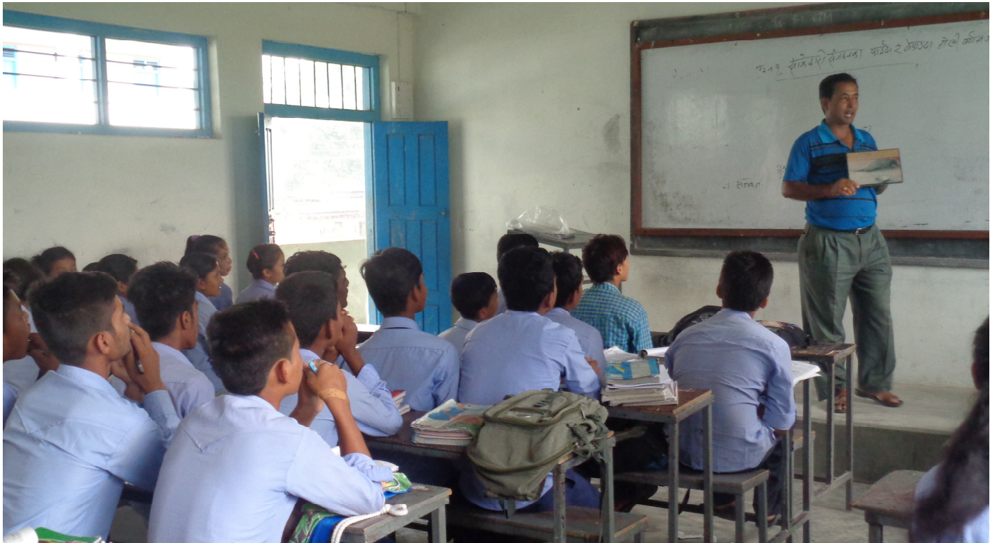
School Teaching Program