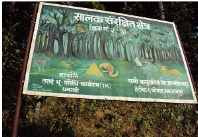
Rani CFUG activity