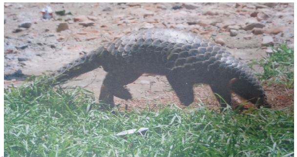
Chinese Pangolin