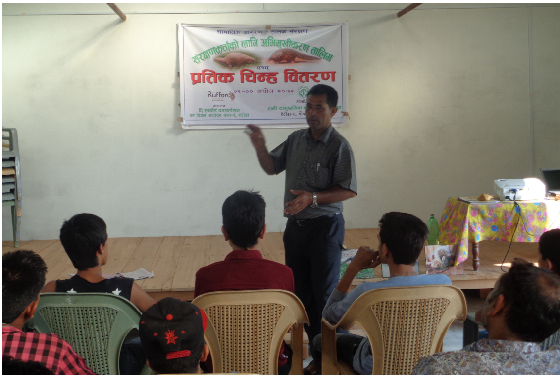
Training on Pangolin Conservation