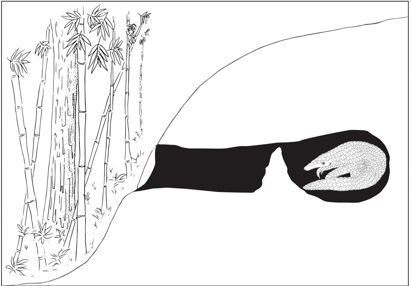
Fig 1. Manis pentadactyla burrow. Illustration of Manis pentadactyla burrow with barrier. Figure is not drawn to scale.

https://doi.org/10.1371/journal.pone.0175450.g001