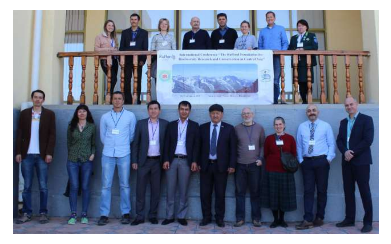
Fig. 1. The Conference Participants group photo