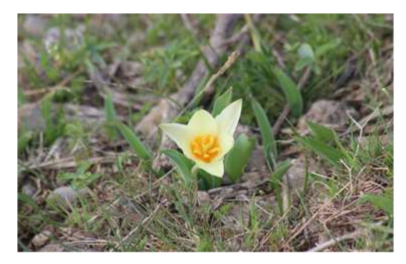
Fig. 17. Turkestan Tulip ( Tulipa turkestanica ) – one of the early blossoming flowers of Aksu-Zhabagly Nature Reserve area

The photographer took plenty great pictures.