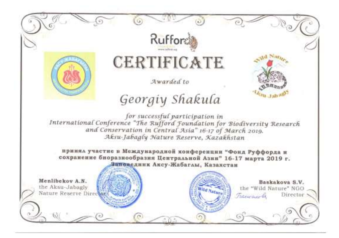
Fig 14. The Certificate sample

The certificates of participation as well as books on Kazakhstan biodiversity and small memory souvenirs were awarded to the speakers on the closing ceremony at the end of the second day.