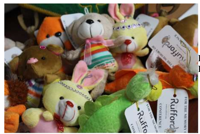
Fig 19. Souvenirs for participants with the Rufford Foundation logo.