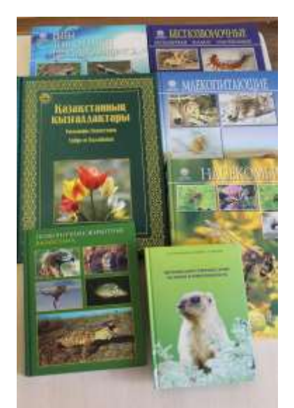
Fig. 15. The books as the presents for participants

Late afternoon of the second day was fitted to outdoor excursion to the Mashat canyon to see the unique site with an only place in the World with wild growing Lemmers' Tulips in the blossom. More 60 other wild growing plant species were seen under guidance of Eugeniy Belousov – the local natural historian and patriarch of ecological tourism development in Aksu-Zhabagly. Many species of migrating birds were seen including Demoiselle Cranes and Pied Wheatear.