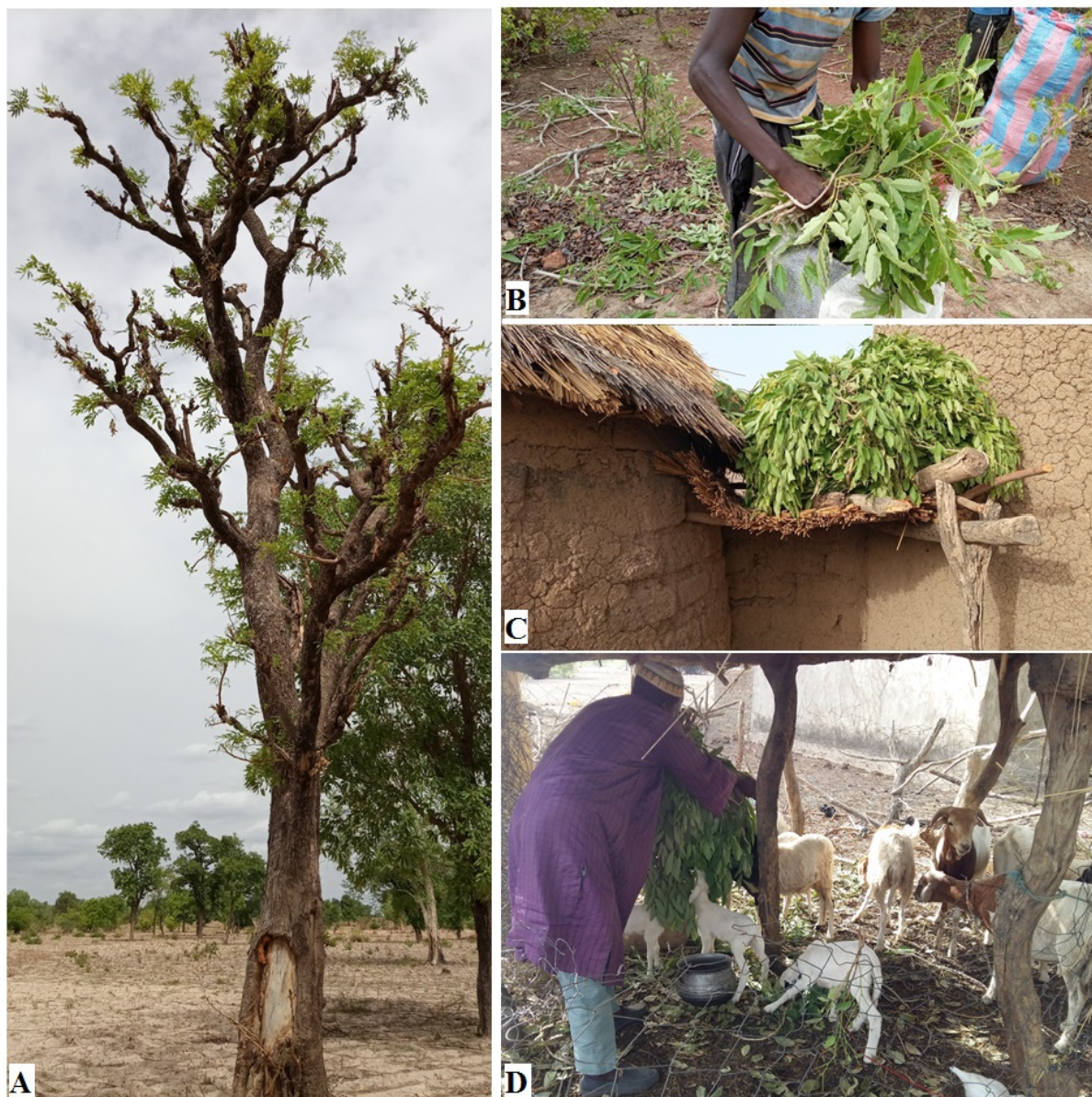
Figure 3. Process of harvesting Pterocarpus erinaceus Poir. leafy branches for livestock feeding: (A) Branch pruning; (B) Harvesting of leafy twigs; (C) Storage of leafy twigs and (D) Livestock feeding

landscape and increased human pressure on certain species, and thus can provide accurate information about species dynamics more than children (Ouoba et al. 2014, Paré et al. 2010). Some studies have also shown that children have little botanical and ethnobotanical knowledge compared to old persons (Ayantunde et al. 2008, Tiétiambou et al. 2020).