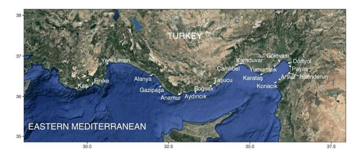
Figure 2. Map of investigation area and positions of visited fishery ports (Basemap were obtained from Google Earth)

Bay, where there were industrial facilities opportunities. providing alternative employment