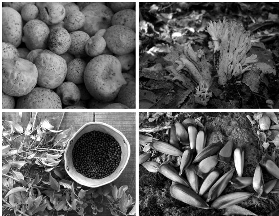
Figure 1. Most salient wild edible plants according to Smith's Saliency Index. From left to right and top to bottom: digüeñe , changle , maqui , and piñones .

cohesion and knowledge transmission (Herrmann 2006). Although people in the community do not strictly depend on the piñon anymore, families always make the effort to have piñones . Whenever someone in the extended family comes back from piñoneando (the act of gathering piñones ), it is customary to share the harvest with kin. This is especially true with elders, as they are most eager to eat wild foods. As one elder expressed, while he peeled and savored some boiled piñones that his son had brought him from the mountains, "When I taste them, I feel that I am back in the mountains."