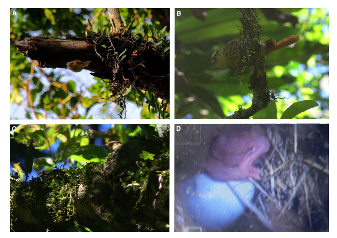
Fig. 1. Nesting of (A) Ochre-breasted Foliage-gleaner ( Anabacerthia lichtensteini ) and (B–D) Sharp-billed Treehunter ( Heliobletus contaminatus ) at Parque Provincial Cruce Caballero, Misiones, Argentina. (A) Adult A. lichtensteini flies from its nest cavity on 7 October 2015 (Photographed by Carlos A. Alderete). (B) Adult H. contaminatus carries nesting material on 3 November 2010 (Photographed by K. L. Cockle). (C) Adult H. contaminatus looks from its nest cavity on 3 November 2010 (Photographed by K. L. Cockle). (D) Video-monitor view of newly hatched nestling and unhatched egg of H. contaminatus on 20 November 2010 (Photographed by José M. Segovia). [Color figure can be viewed at wileyonlinelibrary.com]

cavity nesters (Syndactyla-Anabacerthia-Anabazenops). Although we cannot discard the hypothesis that some members of Philydorini exhibit plasticity in nest placement, there is currently no conclusive evidence that either P. rufum or any other member of the first clade nests in tree cavities or that P. atricapillus, S. rufosuperciliata, or any member of the second clade nests in burrows. Although treecavity nesting can sometimes arise in burrownesting lineages of Furnariidae, such as Cinclodes (Ojeda 2016), current evidence suggests that the nests of Cichlocolaptes and Megaxenops - which remain undescribed will eventually be found in existing tree or bamboo cavities, like the nests of their relatives in Anabacerthia, Heliobletus, Syndactyla, and Anabazenops.