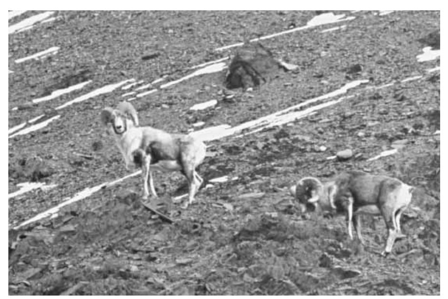
Figure 5—Two adult Tibetan argali rams grazing in the Tsabra catchment of Gya-Miru, Ladakh.

The Asiatic ibex is a majestic wild goat that is about 80 to 100 cm (31 to 40 in.) high at the shoulder, and that weighs an average of 60 kg (132 lbs). The species is partial to rugged areas, as it has strong and muscular legs that help it negotiate steep cliffs (Namgail 2006b). The species is the second most abundant wild ungulate in Ladakh after the blue sheep (Namgail 2006b). The Asiatic ibex was hunted heavily in