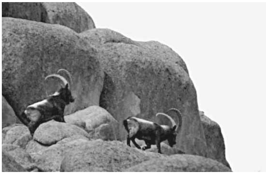
Figure 4—Two full-grown male Asiatic ibex in their rocky habitat in western Ladakh.

the Kalak Tartar plateau, the last stronghold of gazelle in Ladakh. Competition with domestic sheep and goats was found to be the most important threat to the long-term survival of the animal (Namgail et al. 2008a). The current estimated population of the species in Ladakh is fewer than 100 animals (Namgail et al. 2008a).