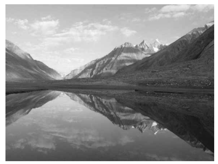
Figure 7—A typical blue sheep habitat with rugged terrain that is secured from predators such as the wolf and the snow leopard, which are less agile in steep cliffs.

The wild ungulates in the Sham area cause crop damage. Although compensation to farmers may serve as an immediate solution, preventive measures should be worked out to reduce the overall level of crop damage in the long run. The wild ungulates in eastern Ladakh, in contrast, were mainly threatened by increasing livestock population. This is especially so after the increase in livestock population in the wake of increased demand for cashmere wool (Namgail et al. 2007a). The current rate of increase in the livestock population is unsustainable, and as such is detrimental to both livestock and wildlife. Identifying crit-