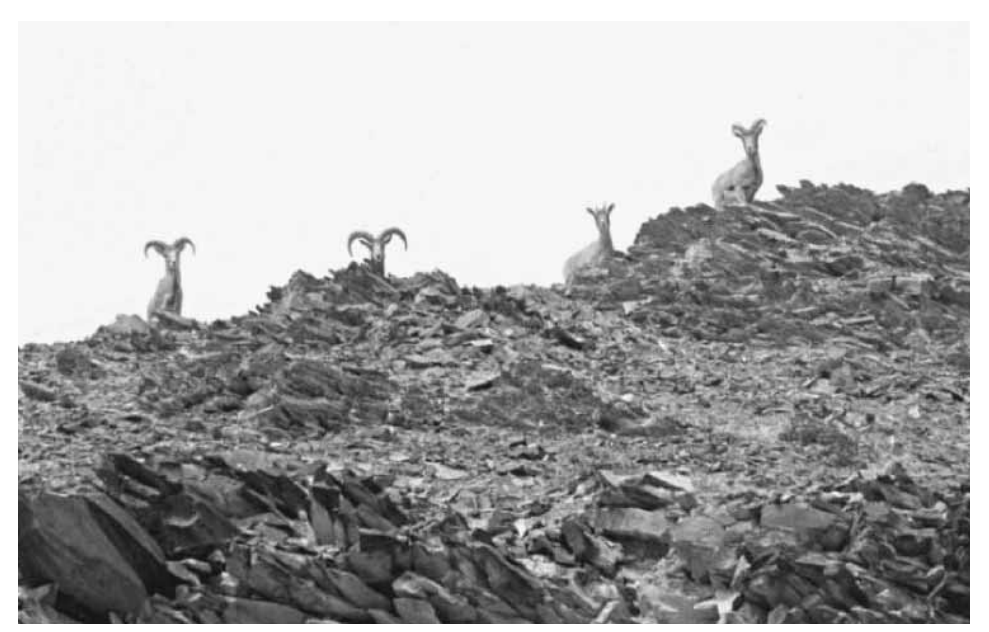
Figure 6—A herd of Ladakh urial in the western part of Ladakh.

the past by both trophy and meat hunters (Fox et al. 1992), and the present population is very sparsely distributed. During the present surveys carried out mostly during summer, I saw 15 individuals near the Hemis Shukpachan and a group of 13 individuals near Hanupatta before the Singge Pass. It is estimated that there are about 6,000 individuals in Ladakh.