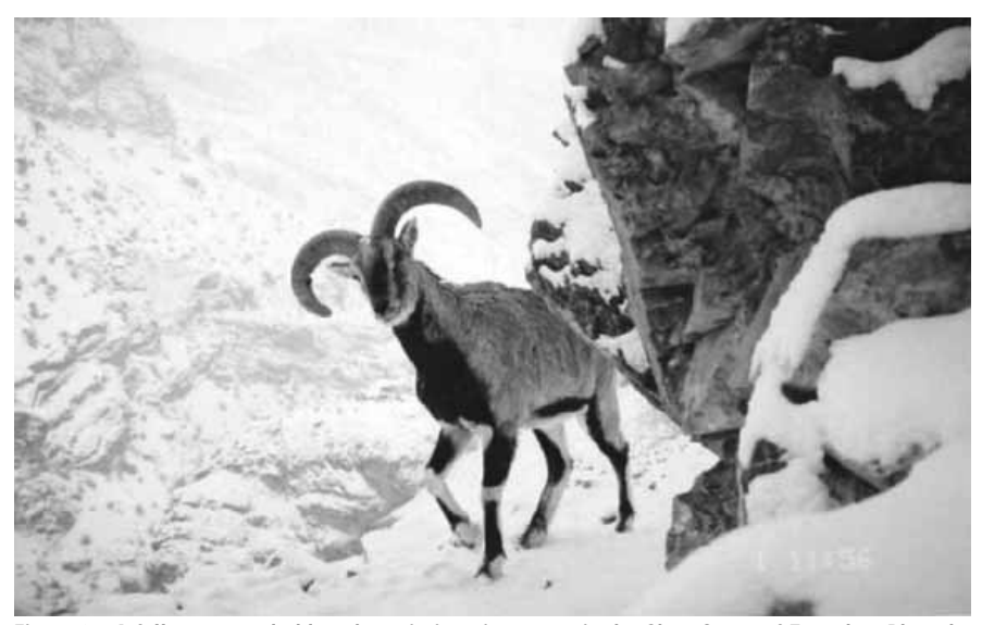
Figure 3—A full-grown male blue sheep in its winter coat in the Shun Gorge of Zangskar.

The surveys were carried out in two phases. During the first phase, Changthang (March 2005) and Sham (April 2005 and June 2006) areas were surveyed, and the second phase covered Zangskar (July 2006) and Nubra (August 2006). The surveys largely involved driving to different areas and observing mountain ungulates, and also