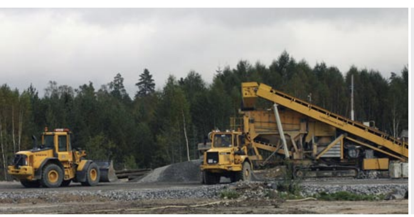
Quarry, Jordbro