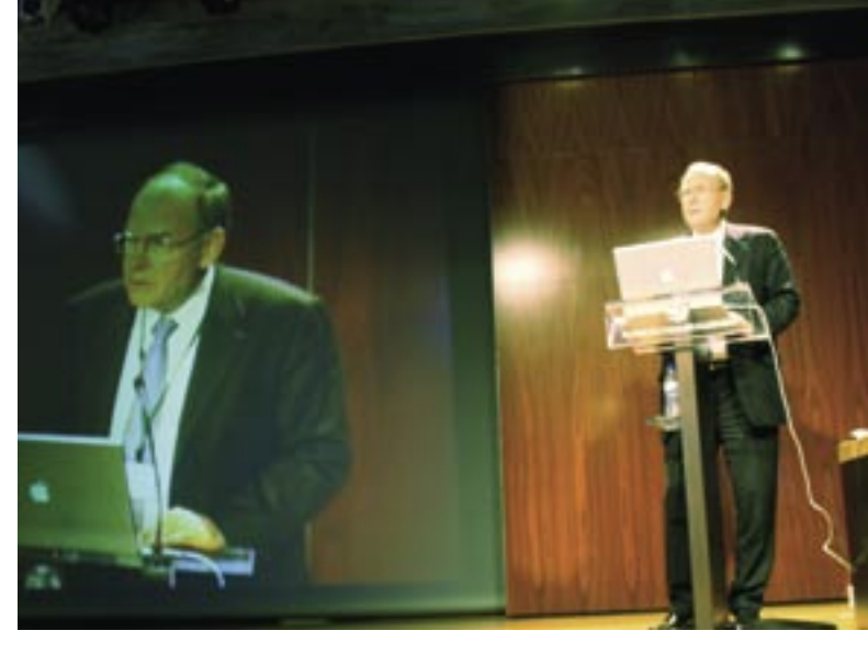
Opening Plenary: Peter Carl

My message to you is that even if you are not inspired or persuaded by the need to protect some endangered species, to protect biodiversity not only makes very sound economic sense, but it is also indispensable for our future wellbeing.