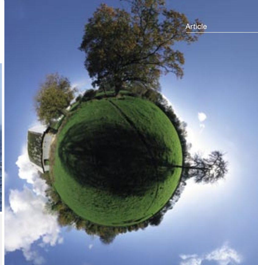
Little Normandy @ Alexis Perez

mechanisms equitably and sustainably. Similarly, a lack of experience with market-based approaches to ecosystem management may result in further harm to ecosystems and their services. Finally, some of the most vital ecosystem services, such as regulating and supporting services, are actually the most difficult to "bring to market".