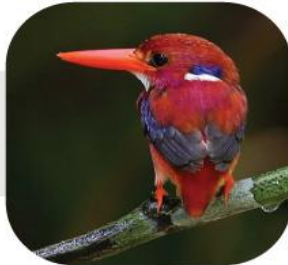
Ceyx melanurus Philippine dwarf kingfisher Endemic and Vulnerable