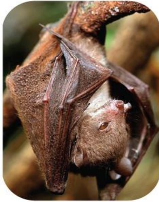
Haplonycteris fischeri Philippine pygmy fruit bat Endemic and Vulnerable