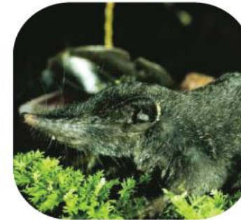
Crocidura beatus Miller, 1910 Common Mindanao shrew Endemic and Vulnerable