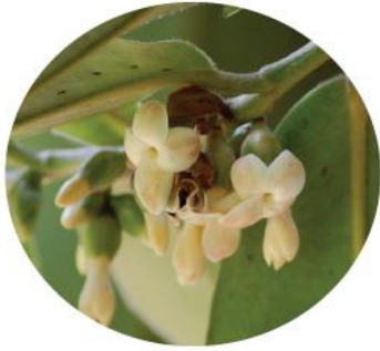
Diospyros philippinensis A.DC. EBENACEAE Endangered and endemic; 240 - 820 masl; San Isidro, Davao Oriental