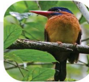
Actenoides hombroni (Bonaparte, 1850) Blue-capped kingfisher Endemic and Vulnerable