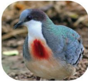
Gallicolumba criniger Mindanao bleeding heart Endemic and Vulnerable