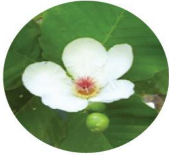
Dillenia philippinensis Rolfe Endemic, rare and source of lumber; In Agro-ecosystem; 70 mas; San Isidro, Davao Oriental