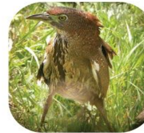
Gorsachius goesagi (Temminck, 1835) Japanese night heron Migrant and endangered