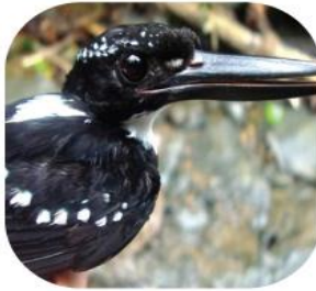
Alcedo argentata (Tweeddale, 1877) Silvery kingfisher Endemic and Vulnerable