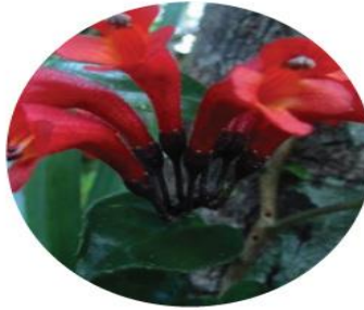
Agalmyla sp. Hemi-epiphyte; In Montane forest; 955 masl; San Isidro, Davao Oriental

Mount Hamiguitan Range Wildlife Sanctuary (MHRWS) is one of the only two highly distinguished UNESCO and ASEAN heritage sites in the Philippines. It provides a haven to globally threatened and endemic flora and fauna species, of which eight are found nowhere else except in Mount Hamiguitan. These include critically endangered trees, plants and the iconic Philippine Eagle and Philippine Cockatoo. MHRWS lies in the southernmost part of the Philippines in the province of Davao Oriental in Mindanao and straddles two municipalities and one city namely Governor Generoso, San Isidro and Mati City. It has an altitude of 75 to 1,637 masl and contains highly unique geological and biological features. It is the only protected forest noted for having the largest and most unique pygmy or bonsai forest with century old trees thriving in a highly basic ultramafic soil. MHRWS belongs to the Philippine Biogeographic Zone 14 known to have the highest land based biological diversity per unit area. It was declared a UNESCO World Heritage Site on June 23, 2014 and has been officially declared as the 34th ASEAN Heritage Park on October 30-31, 2014. Truly it is a pride not only of Davao Oriental but of the Philippines.