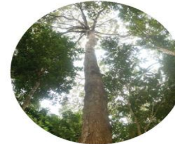
Shorea negrosensis Foxw. Vulnerable and endemic; San Isidro, Davao Oriental