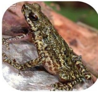
Ansonia muelleri (Boulenger, 1887) Mindanao lesser fanged frog Endemic and Vulnerable

Mount Hamiguitan Range Wildlife Sanctuary (MHRWS) is one of the only two highly distinguished UNESCO and ASEAN heritage sites in the Philippines. It provides a haven to globally threatened and endemic flora and fauna species, of which eight are found nowhere else except in Mount Hamiguitan. These include critically endangered trees, plants and the iconic Philippine Eagle and Philippine Cockatoo. MHRWS lies in the southernmost part of the Philippines in the province of Davao Oriental in Mindanao and straddles two municipalities and one city namely Governor Generoso, San Isidro and Mati City. It has an altitude of 75 to 1,637 masl and contains highly unique geological and biological features. It is the only protected forest noted for having the largest and most unique pygmy or bonsai forest with century old trees thriving in a highly basic ultramafic soil. MHRWS belongs to the Philippine Biogeographic Zone 14 known to have the highest land based biological diversity per unit area. It was declared a UNESCO World Heritage Site on June 23, 2014 and has been officially declared as the 34th ASEAN Heritage Park on October 30-31, 2014. Truly it is a pride not only of Davao Oriental but of the Philippines.