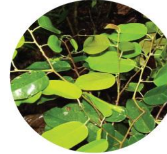
Shorea polysperma Merr. Endemic and vulnerable; In agro-ecosystem to montane forest, Mati and San Isidro, Davao Oriental