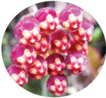
Hoya panchoi Kloppenburg Endangered and endemic; 1120 masl; San Isidro, Davao Oriental