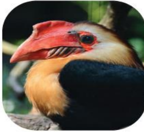
Aceros leucocephalus (Vieillot, 1816) Wreathed hornbill Endemic

Mount Hamiguitan Range Wildlife Sanctuary (MHRWS) is one of the only two highly distinguished UNESCO and ASEAN heritage sites in the Philippines. It provides a haven to globally threatened and endemic flora and fauna species, of which eight are found nowhere else except in Mount Hamiguitan. These include critically endangered trees, plants and the iconic Philippine Eagle and Philippine Cockatoo. MHRWS lies in the southernmost part of the Philippines in the province of Davao Oriental in Mindanao and straddles two municipalities and one city namely Governor Generoso, San Isidro and Mati City. It has an altitude of 75 to 1,637 masl and contains highly unique geological and biological features. It is the only protected forest noted for having the largest and most unique pygmy or bonsai forest with century old trees thriving in a highly basic ultramafic soil. MHRWS belongs to the Philippine Biogeographic Zone 14 known to have the highest land based biological diversity per unit area. It was declared a UNESCO World Heritage Site on June 23, 2014 and has been officially declared as the 34th ASEAN Heritage Park on October 30-31, 2014. Truly it is a pride not only of Davao Oriental but of the Philippines.