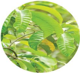
Myristica philippinensis Gadger Threatened and endemic, 320-640 masl, San Isidro, Davao Oriental