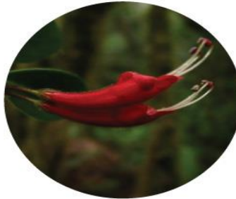
Aeschynathus miniaceus BL Burt & PJB Woods Endemic, vulnerable and ornamental; Hemi-epiphyte; In Montane forest; 1250, 1084 masl; San Isidro, Davao Oriental