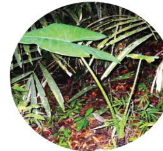
Alocasia zebrina Schott ex Van Houtte Endangered and endemic; 685 masl; San Isidro, Davao Oriental