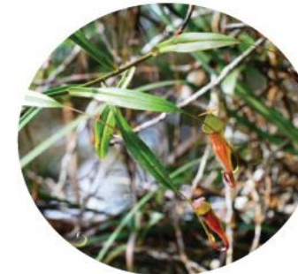
Nepenthes micramphora V.B.Heinrich, S.McPherson, Gronem. & V.B.Amoroso Endangered, endemic and rare; In ultramafic substrate; 980- 1,560 masl; San Isidro, Davao Oriental