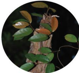
Gnetum latifolium Blume Rare; 920 - 1145; San Isidro, Mati