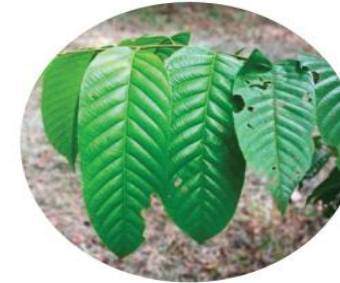
Shorea guiso (Blanco) Blume Vulnerable and endemic; 240- 820 masl; San Isidro, Davao Oriental