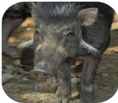
Sus philippensis Nehring, 1886 Philippine warty pig Endemic and Vulnerable