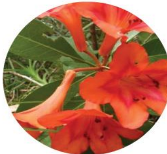
Rhododendron kochii Stein. Endemic; In Dipterocarp forest – 790 masl; Montane forest – 1120 masl; San Isidro, Davao Oriental