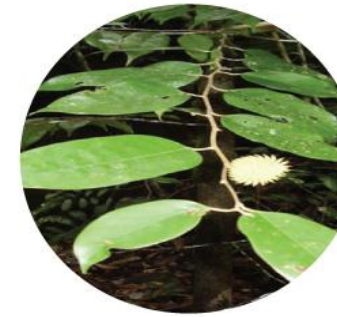
Shorea astylosa Foxw. Endemic and critically endangered; In agroecosystem to montane forest, Mati and San Isidro, Davao Oriental