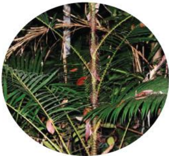
Calamus sp. Hemi-epiphyte; In Montane forest; 1215 masl; San Isidro, Davao Oriental