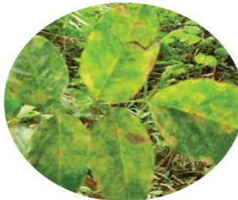
Shorea contorta Vid. Endemic and vulnerable; In agro-ecosystem to mossy forest, Mati and San Isidro, Davao Oriental