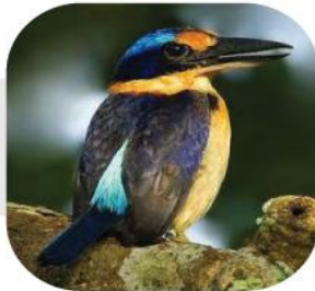
Todiramphus winchelli (Sharpe, 1877) Rufous-lored kingfisher Endemic and Vulnerable