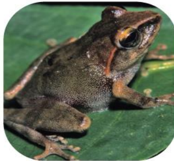
Philautus acutirostris (Peters, 1867) Point snouted bush frog Endemic and Vulnerable