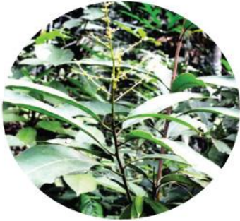
Mangifera altissima Blanco Vulnerable, 120-540 masl, San Isidro, Davao Oriental