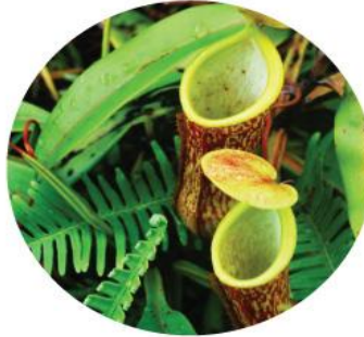
Nepenthes alata Blanco Endemic, rare, ornamental; usually in montane forest, rarely in ultramafic soils; 400-1146 m asl; Entire Hamiguitan Range