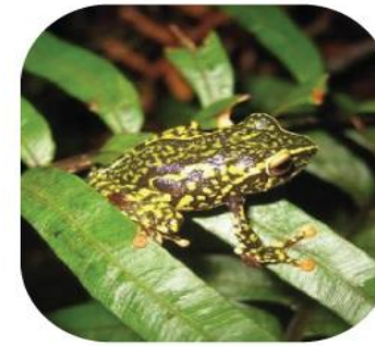
Philautus poecilus Brown & Alcala, 1994 Mindanao lesser fanged frog