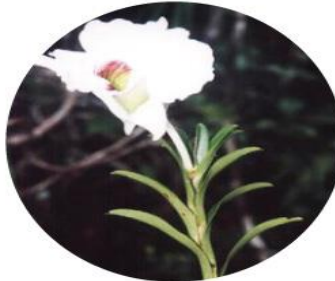
Dendrobium sanderae Rolfe var. surigaense Quisumb.; Endemic; Epiphyte; In Pygmy forest; 1145 masl; San Isidro, Davao Oriental