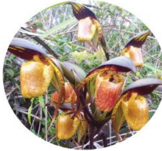
Paphiopedilum adductum Asher Endemic, critically endangered, rare and ornamental; Terrestrial; In Grassland; 1135 masl; San Isidro, Davao Oriental