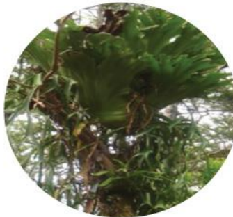
Platycerium coronarium (Muell.) Desv. Critically endangered and ornamental; Epiphytic; Dipterocarp forest, 210 masl, Mati, Davao Oriental