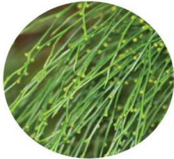
Psilotum nudum (L.) Beauv. Vulnerable and ornamental; Terrestrial; In dipterocarp to mossy-pygmy forest; 540-1150 masl; San Isidro and Mati, Davao Oriental