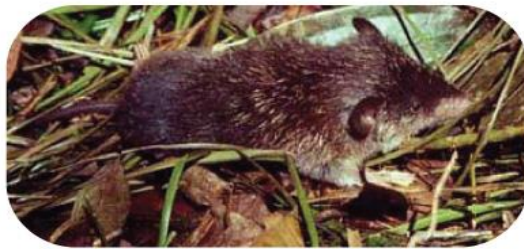
Podogymnura truei Mearns, 1905 Mindanao gymnure Endemic and Endangered