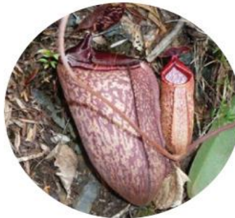
Nepenthes peltata Sh.Kurata Rare and endemic; Usually in montane forest, rarely in ultramafic soils; 870-1200 masl; San Isidro, Mati, Gov. Generoso