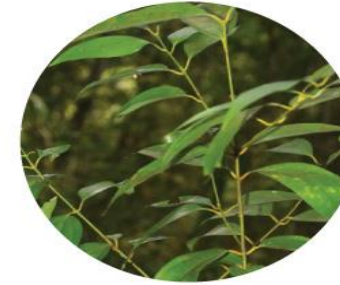
Cinnamomum mercadoi Vidal Vulnerable and endemic; 920-1100 masl; San Isidro, Davao Oriental