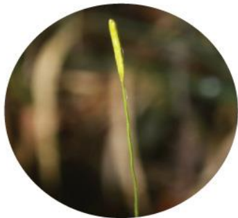
Schizaea inopinata Selling Rare; Terrestrial; In dipterocarp-montane forest, 920 masl; San Isidro, Davao Oriental