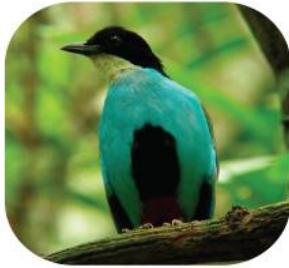
Pitta steerii (Sharpe, 1876) Azure breasted pitta Endemic and Vulnerable