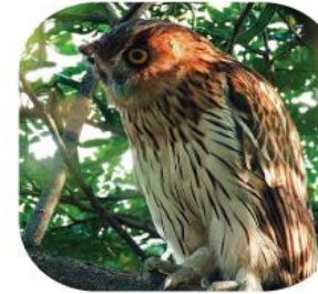
Bubo philippensis Kaup, 1851 Philippine eagle owl Endemic and Vulnerable