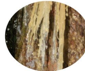
Agathis philippinensis Warb. Endemic, vulnerable and source of lumber; In Primary Montane forest; 960 m asl-1200 masl; San Isidro & Mati, Davao Oriental