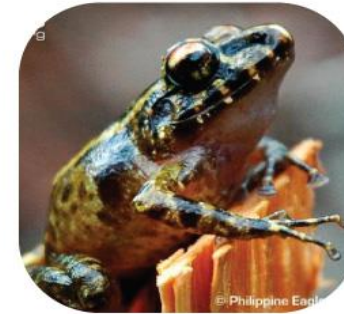
Philautus poecilus Brown & Alcala, 1994 Mindanao lesser fanged frog Endemic and Vulnerable