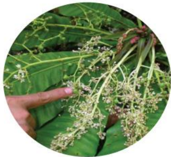
Buchanania nitida Engl. Endemic; In Agro-ecosystem; 140-1200 masl; San Isidro, Mati, Davao Oriental