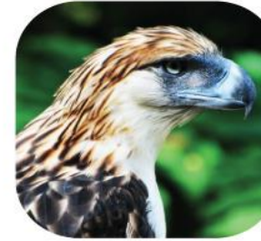
Pitheophaga jefferyi Ogilvie-Grant Philippine eagle Endemic and Critically endangered