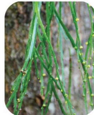
Psilotum complanatum Sw. Rare; 280 masl, Gov. Generoso, Davao Oriental