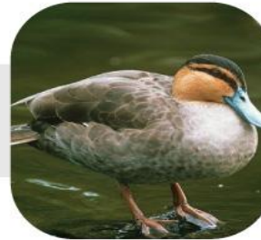
Anas luzonica Fraser, 1839 Philippine duck Endemic and Vulnerable