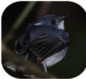
Ficedula basilanica (Sharpe, 1877) Little slaty flycatcher Endemic and Vulnerable