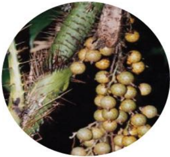
Calamus merrillii "Gataran" Endemic; Hemi-epiphyte; In Montane forest; 370 m asl Mati, Davao Oriental