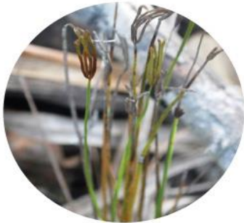
Schizae malaccana Bak. Rare, terrestrial In dipterocarp forest; 840 masl; San Isidro, Davao Oriental