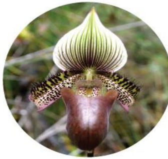
Paphiopedilum ciliolare (Reichenbach f.) Stein Endemic, endangered, rare and ornamental Terrestrial; In Montane forest; 922 masl; San Isidro, Davao Oriental

Mount Hamiguitan Range Wildlife Sanctuary (MHRWS) is one of the only two highly distinguished UNESCO and ASEAN heritage sites in the Philippines. It provides a haven to globally threatened and endemic flora and fauna species, of which eight are found nowhere else except in Mount Hamiguitan. These include critically endangered trees, plants and the iconic Philippine Eagle and Philippine Cockatoo. MHRWS lies in the southernmost part of the Philippines in the province of Davao Oriental in Mindanao and straddles two municipalities and one city namely Governor Generoso, San Isidro and Mati City. It has an altitude of 75 to 1,637 masl and contains highly unique geological and biological features. It is the only protected forest noted for having the largest and most unique pygmy or bonsai forest with century old trees thriving in a highly basic ultramafic soil. MHRWS belongs to the Philippine Biogeographic Zone 14 known to have the highest land based biological diversity per unit area. It was declared a UNESCO World Heritage Site on June 23, 2014 and has been officially declared as the 34th ASEAN Heritage Park on October 30-31, 2014. Truly it is a pride not only of Davao Oriental but of the Philippines.