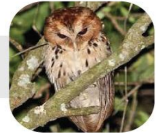
Mimizuku gurneyi (Tweeddale, 1879) Giant scops owl Endemic and Vulnerable