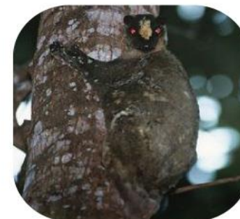
Cynocephalus volans (Linnaeus, 1758) Flying lemur Endemic and Vulnerable