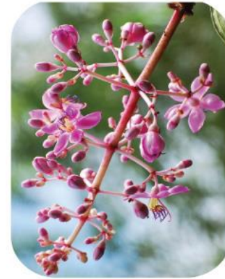
Medinilla cumingii Naudin Endemic; 540-820 masl; San Isidro, Davao Oriental