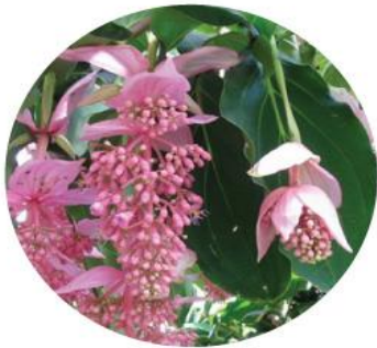
Medinilla magnifica Lindl. Endangered and endemic; 420-980 masl; San Isidro, Davao Oriental