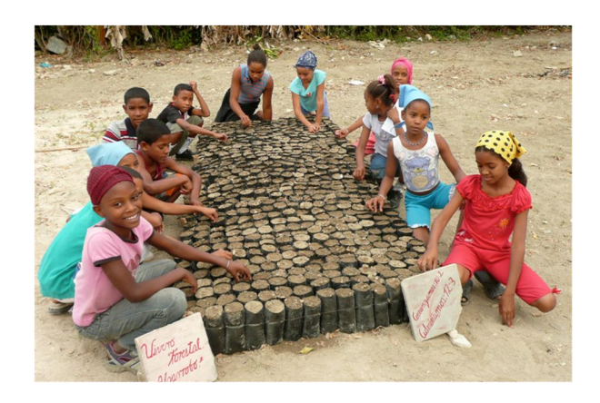
Children from the community beside seedlings

In 2010, Falls Brook Centre received an extension to CIDA's funding and is now constructing a water system that will bring water to the farms. Everyone involved in the project believes that the secure access to water will give an incredible boost to the project's results. The farmers know a lot about Analog Forestry, and they will soon have the means to put it in practice.