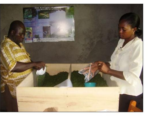
Members drying and bagging eru

Communal efforts in promoting Analog Foresty have often been thwarted by cattle farmers who continue to graze their cattle in "protected areas" where