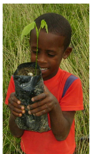
Young boy with a seedling

Some farmers and members of the Forest Institute have even had the chance to