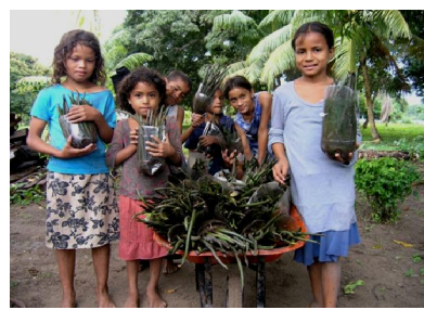
Local children holding red magrove seedlings

A pilot project demonstration site has been developed comprising a total area of 12.5 hectares in a variety of vegetation communities, some of which are in the process of natural regeneration, while the rest of it is a heavily impacted by human activities. Initial plantings of red mangrove have been thriving in the area as are a number of associate species planted further upland.