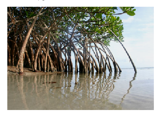
Successful Red Mangrove plantings by the Río Salado

After the success of a 2 year pilot project in the Refugio de Vida Silvestre Cuero y Salado, Falls Brook Centre has recently expanded their work to two additional protected areas along the north coast of Honduras including the Parque National Nombre de Dios and the Parque National Cuyamel. In addition to community nurseries and planting sites, all three locations will include