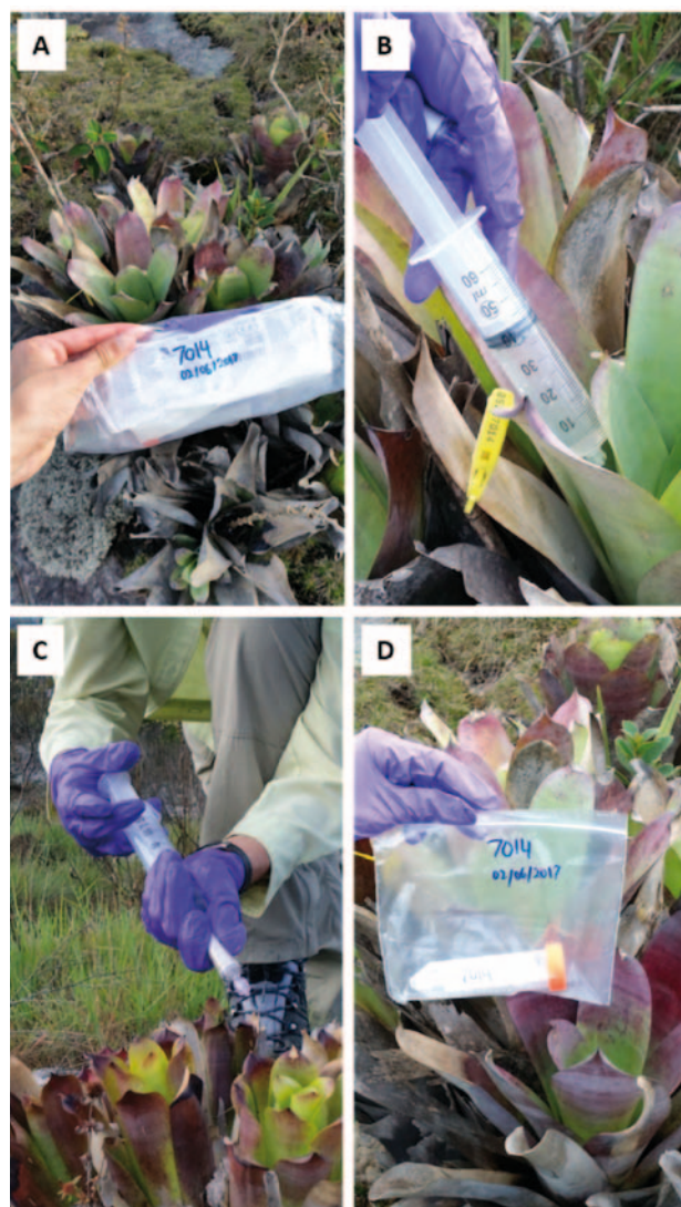
Figure 1. Environmental DNA sample collection demonstration: A) sample collection kit; B) water collection from lateral leaves of the bromeliad using a sterile 60 mL syringe; C) pushing the water across the 0.22 µm filter capsule; and D) individual capsule sealed in a tube and stored in a sample bag to prevent contamination.

field, water was drawn from either the centre or lateral leaves of the bromeliad using the sterile 60 mL luer-lock syringe (Fig. 1B); the filter capsule was attached to this syringe which was used to push the water across the filter membrane (Fig. 1C). This procedure was repeated twice to filter a total of 120 mL of water. Once the whole water sample was filtered or the capsule had become blocked (which was the case for one sample), 10 mL of absolute ethanol was added to each filter as a preservative using the 10 mL syringe and ½" needle. Each capsule was sealed with luer-lock caps, re-sealed in an individual 50 mL centrifuge tube and stored in a sample bag to prevent contamination while in storage and transport (Fig. 1D). We numbered each sample (filters, containers and bags) with the reference number of the bromeliad from individual tags.