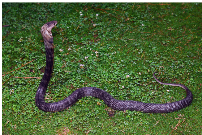
Figure 1. Female N. oxiana displaying juvenile hood markings

Here, we report new observations of N. oxiana (Fig. 1) from Himachal Pradesh in 2017 and 2018. Two live N. oxiana specimens were encountered in the area surrounding Majoga, in the district of Chamba (Fig. 2) during a research expedition undertaken as part of the Bangor University Biodiversity Informatics and Technology Exchange for the Management of Snakebite (BITES) project in 2017. Two further N. oxiana specimens were encountered between June and September 2018 during a collaborative research expedition by BITES,