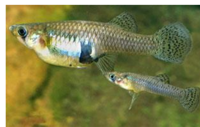
Figure 2. Male (L) and Female (R) G. holbrooki