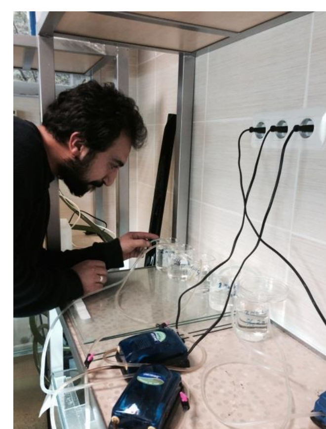
Figure 7. FFBEL