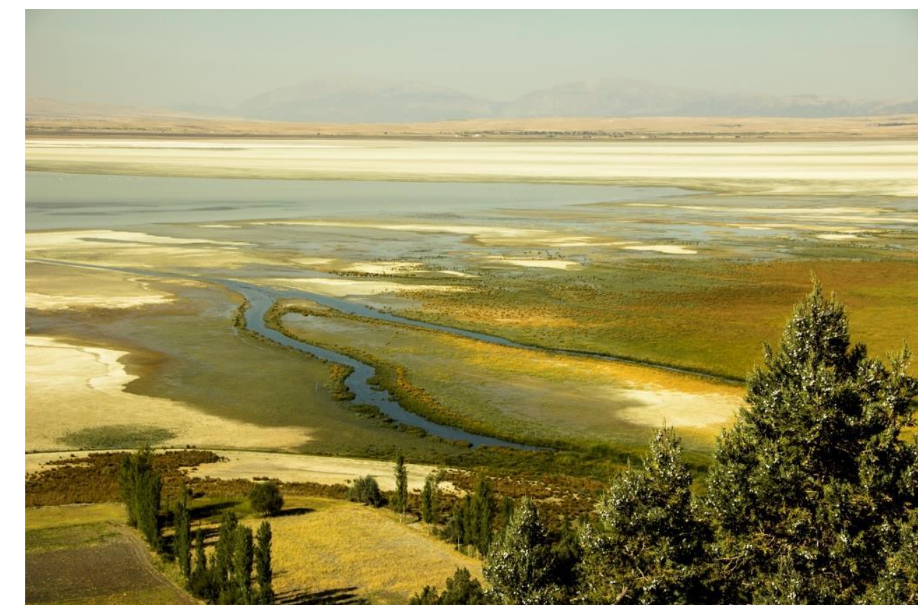
Figure 4. Acıgöl Lake

The study has been conducted since September 2012 in the spring system of the Lake Acıgöl (Figure 4 and 5). The first two surveys were for determining the distribution of Gambusia and Aphanius population in the area by CPUE (Catch per unit effort). Samplings were carried out by a hand seine net having 4 mm mesh size, 3 m length and 1 m height. The CPUE index is calculated as catch in fish number/area.