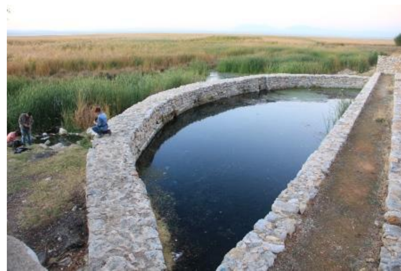
Figure 10. Gambusia -free pond