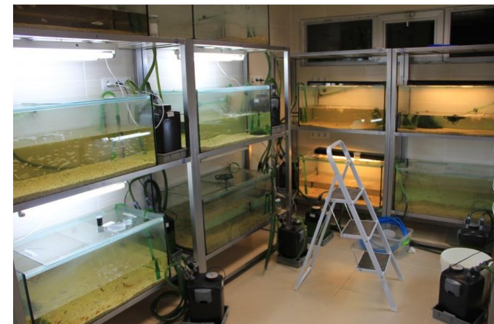
Figure 8. FFBEL