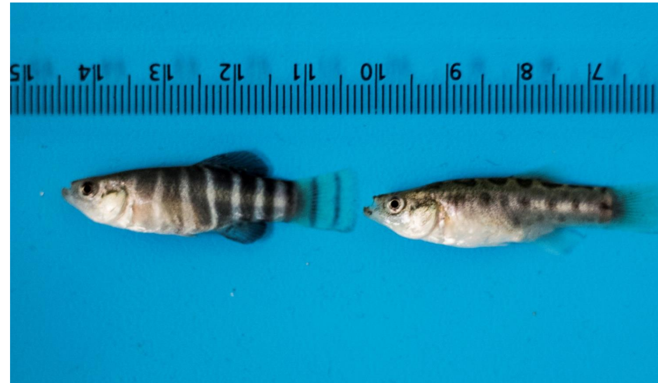
Figure 1. Male (Left) and Female (Right) A. transgrediens

Aphanius transgrediens (Figure 1) is a killifish which should most urgently be protected among other killifishes in Turkey because of being in danger of extinction. The spring system of Lake Acıgöl is the only natural habitat of A. transgrediens and the lake possesses Turkey's largest sodium sulphate reserves extensively used in the industry. In addition to industrial activities, a dense Gambusia holbrooki (Figure 2 and 3) population, which should be regarded as a serious threat to the population of A. transgrediens in this area due to its invasive characteristics and direct predation on fry, was recorded. To this respect, we carried out a conservation study including both in-situ and ex-situ methods to ensure viable stocks of A. transgrediens in order to be reintroduced or restocked into either their native habitat or suitable, alternative habitats. A Gambusia -free pond was used to create sheltered breeding unit for in-situ conservation. In this presentation we demonstrated some reproductive properties of Aphanius transgrediens maintained in aquaria and some other conservation actions.