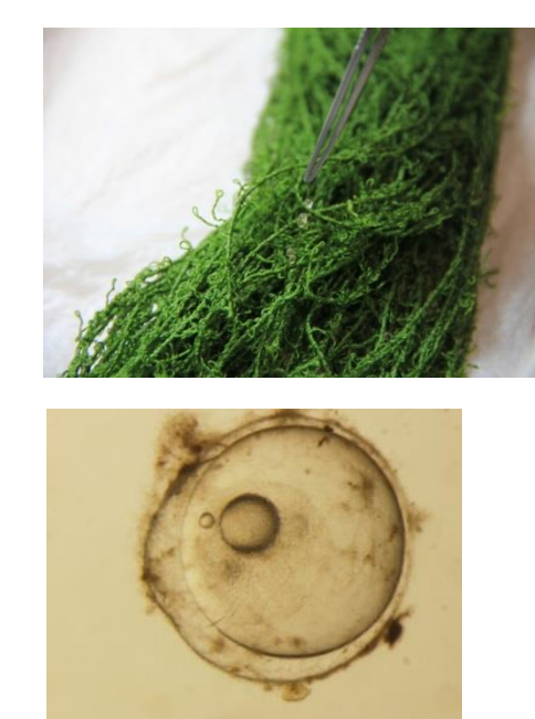
Table 2. Some spawning parameters of Aphanius transgrediens

After 2 weeks of acclimation and maintenance, some male individuals started to exhibit mating behavior and their color turned to darker and brighter pattern. Spawning occurred within two days from this observation. The findings about hatching success, average hatching time and batch size per female is depicted in Table 2. In addition, egg development is demonstrated in Figure 10.