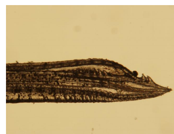
Figure 3. Male gonopodium of G. holbrooki