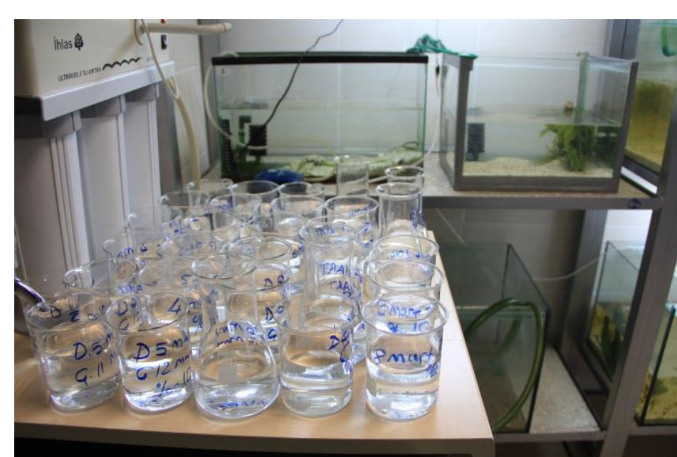
Figure 6. FFBEL

A total of 20 individuals (10 males and 10 females) were transported to the FFBEL (Freshwater Fish Biology&Ecology Laboratory) in Hacettepe University (Figure 6, 7 and 8). Fish were kept in quarantine in 20 L plastic container for 2 days. After acclimation they all placed into a 120 L tank and fed by mosquito larvae and Tetra-rubin flake food. Photoperiod was set as 14L-10D cycle and water temperature ranged between 22-24 °C. Two heaps of orlon mop were placed into the tank to imitate spawning substrate. Mops were controlled under a reading lamp day by day and eggs were collected into a petri dish containing commercial potable water having same temperature as the main tank. All eggs were photographed under Olympus SZX microscope day by day.