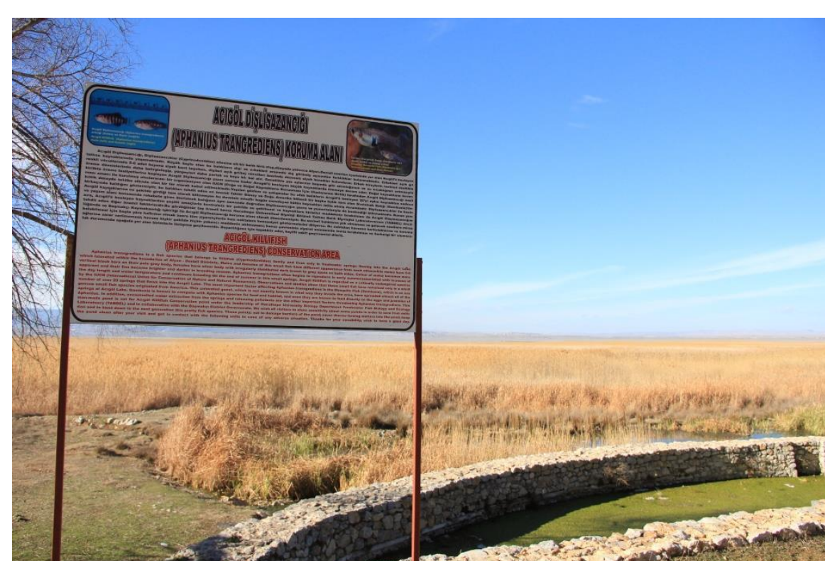
Figure 9. Gambusia -free pond

In order to establish a continuous viable stock of Aphanius transgrediens , a Gambusia -free pond was used by the help of the local administrative authorities. The pond has a hemicycle shape with about 15 m diameter and about 1.5 m depth (Figure 9 and 10). Approximately 250 adult individual were transported into the pond in September 2013.