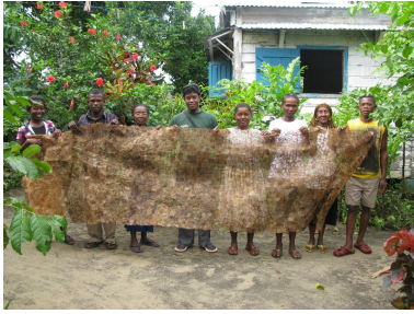
CPALI team and textile