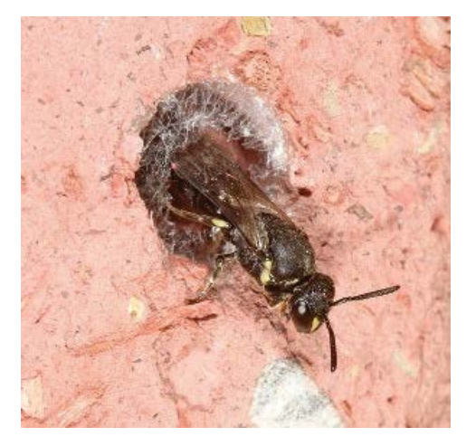
Solitary bee emerges out of a mud wall.