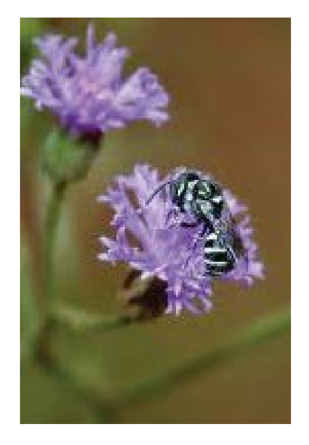
Ceratina sp., a solitary bee that visits many crops.

Apis florea, pollinators in many habitats