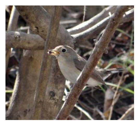
A flycatcher with its insect prey near a vegetable farm.

Small farmers depend on biodiversity for their livelihoods and survival, and they are its main guardians, be it inside forests or on their agricultural land. Farming practices which use and enhance this diversity are common, yet agriculture can also be the greatest destroyer of biodiversity. Monocrops destroy native forest tree diversity as well as agro-biodiversity. Agricultural intensification through chemical fertilizers, pesticides and weedicides kill many sensitive species.