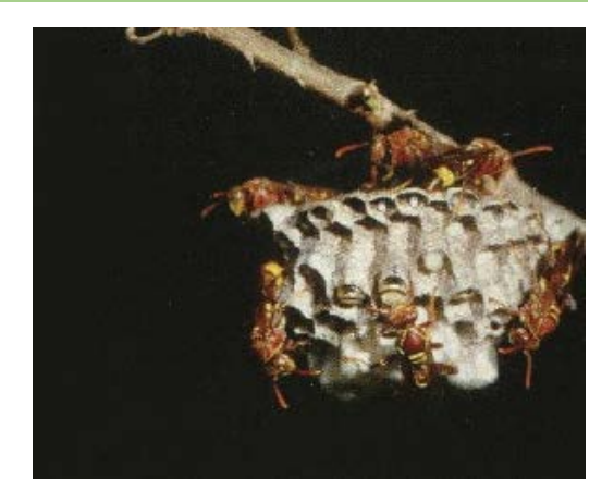
Vespid wasps: They make nests in mud and their larvae feed on insects.

Predators are normally carnivorous and capture other insects as their prey. Spiders are a dominant non-insect predator group. Many wasps, beetles, ants and flies predate upon pests like aphids and borers. A farm is greatly benefitted from the presence of a diversity of natural enemies