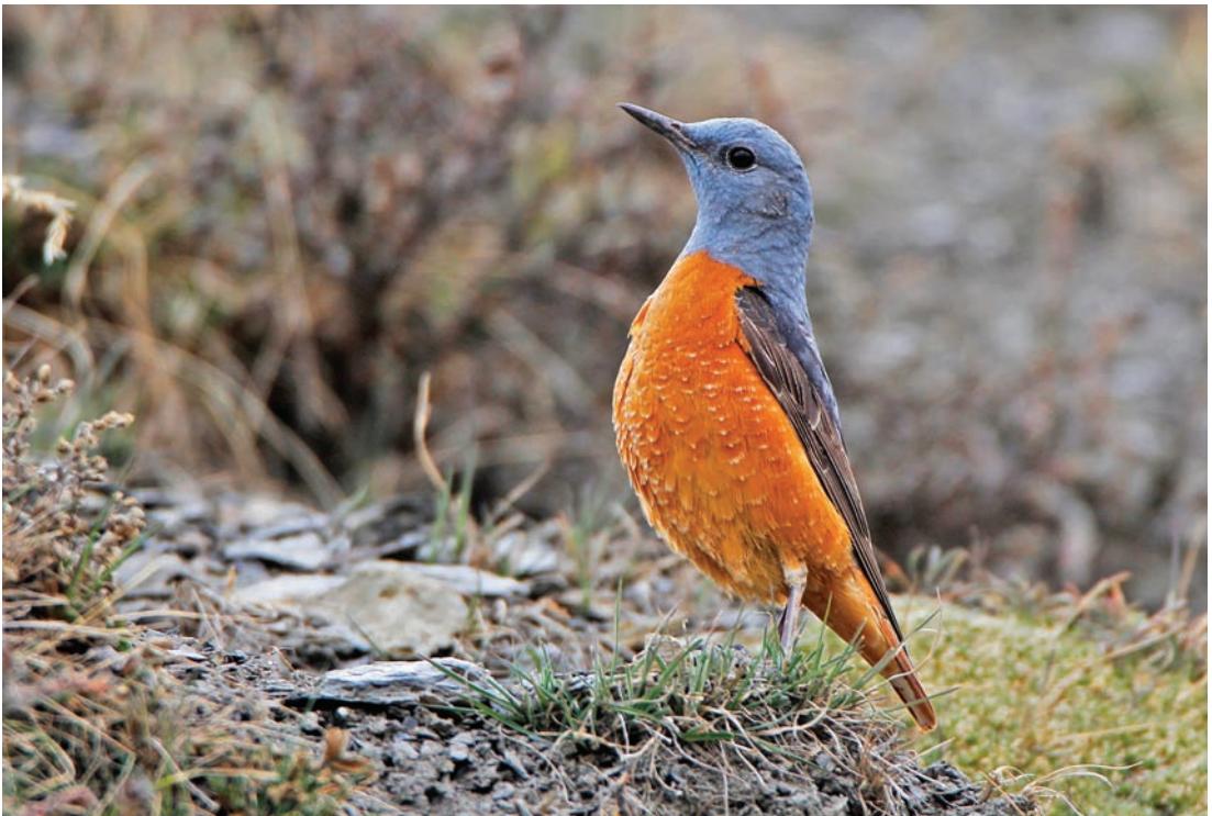
Plate 1. Male Rufous-tailed Rock Thrush Monticola saxatilis , upper Dolpa, Nepal, 27 May 2016.

We thank the Department of National Parks and Wildlife Conservation Nepal for granting research permission, Carol Inskipp and Hem Sagar Baral for confirming the bird's identity