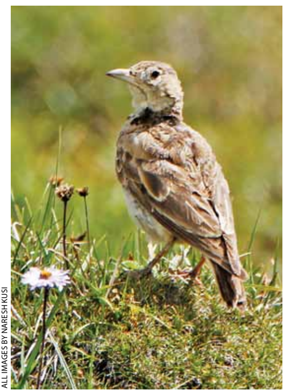
Plate 1. Adult Tibetan Lark Melanocorypha maxima , Gyau valley, Humla district, Nepal, 5 August 2015.