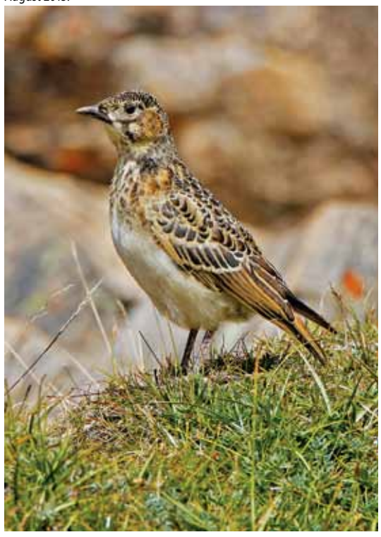
Plate 3 . Juvenile Tibetan Lark, Sakya valley, Humla district, Nepal, 13 August 2015.