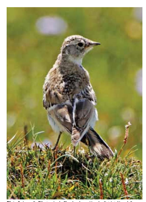
Plate 2. Juvenile Tibetan Lark, Chyakpalung, Humla district, Nepal, 8 August 2015.