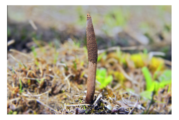
Fig. 1. Ophiocordyceps sinensis in the natural habitat.

from the head of the buried caterpillar (Winkler, 2010a). The fungal stromata grow to \sim 2–6 cm above the soil surface in early spring, when they are harvested along with the subterranean mummified caterpillar (Fig. 1).