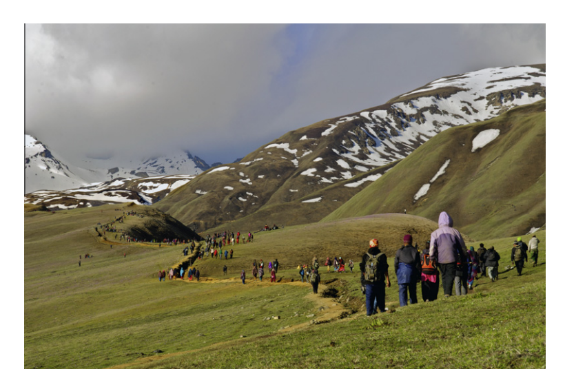
Fig. 3. A caravan of harvesters in Dolpa, Nepal.

data are the only official source of information to quantify total amount of trade. According to revenue figures from the Government of Nepal, only 3.1 kg of caterpillar fungus was officially traded in 2002 from all of Nepal; trade volume reached a peak at 2442.4 kg in 2009 and then declined to 1170.8 kg in 2011 (Fig. 4A). From Dolpa district, 3.1 kg was marketed in 2002 (this was the only district of Nepal officially marketing the fungus in that year). Dolpa trade volume peaked at 872.4 kg in 2009 and then declined continuously to 473.8 kg in 2011. In that year, revenue on fungus trade was collected from five districts (Darchula, Dolpa, Jumla, Kathmandu and Myagdi), showing that trade has expanded spatially, despite falling total volumes characterizing the last few years.