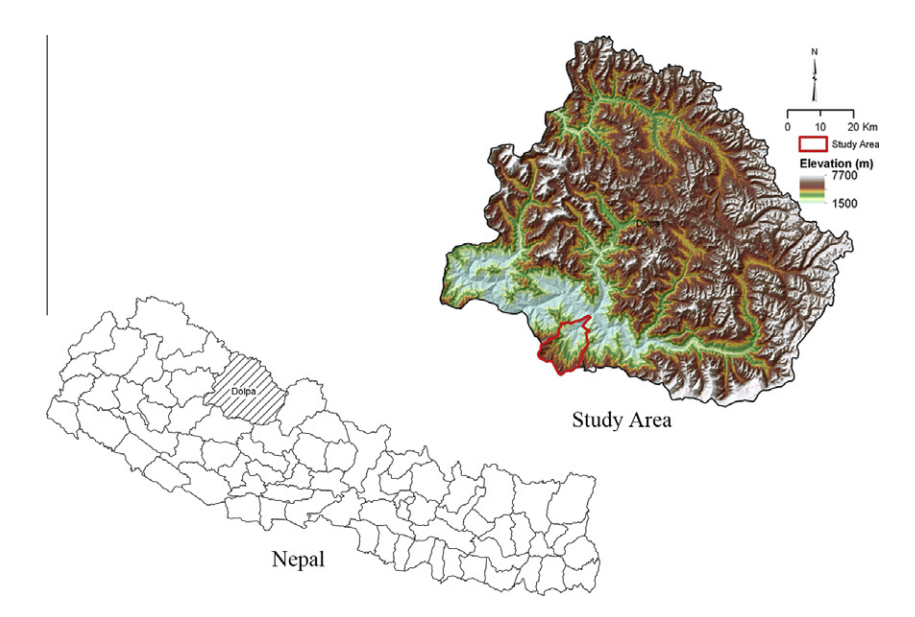
Fig. 2. Map of the study area.