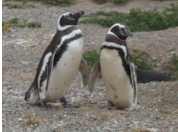
Left: Field work team at San Lorenzo Penguin Colony, Peninsula Valdes. Right: Magellanic penguin adult at nest.