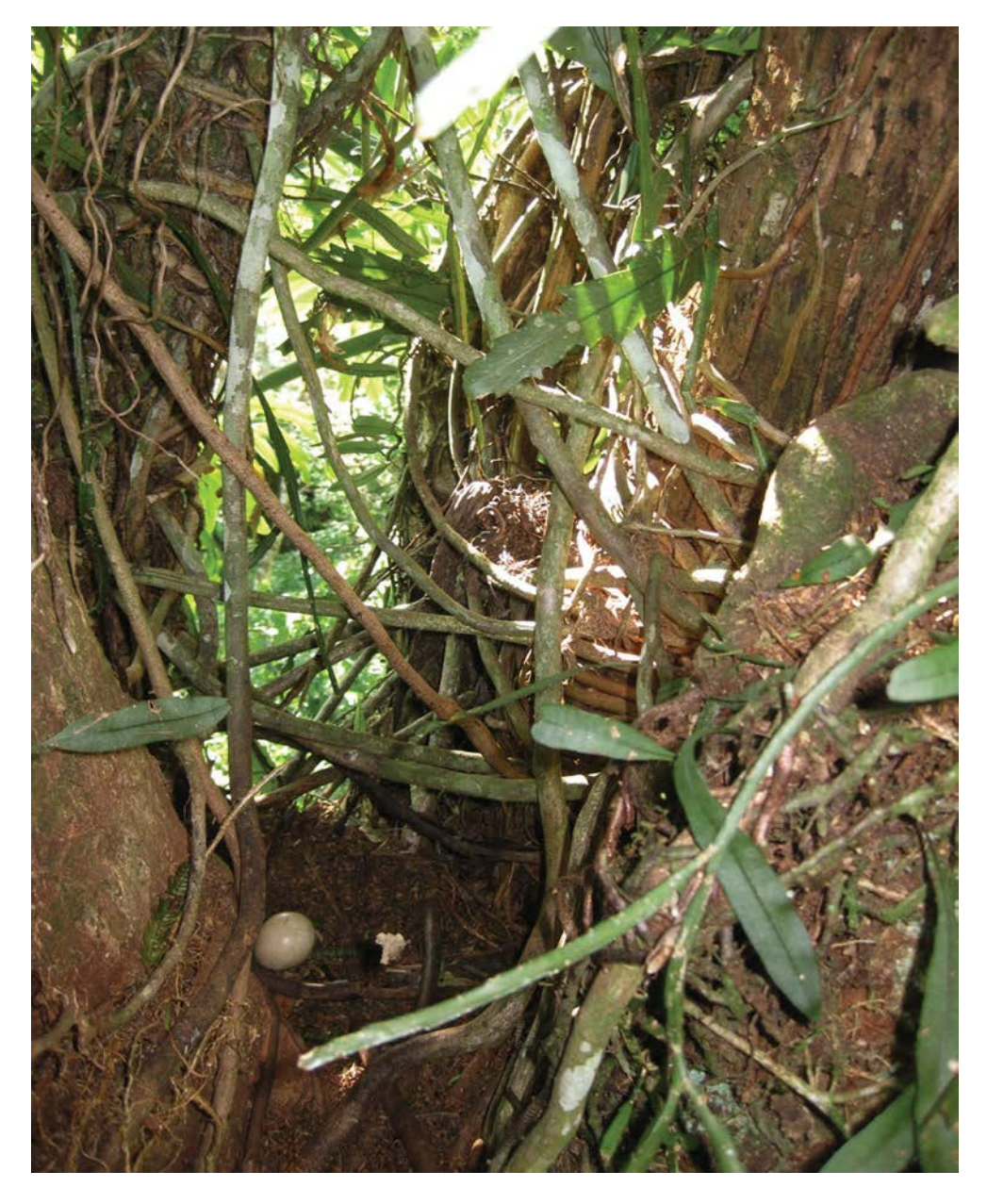
FIG. 3. Black-banded Owl egg among epiphytes in tree fork nest, 30 Nov 2012.

arrived; other times an adult arrived alone, fed the nestling, and then either stayed on the nest (presumed female) or left immediately (presumed male). For example, on the