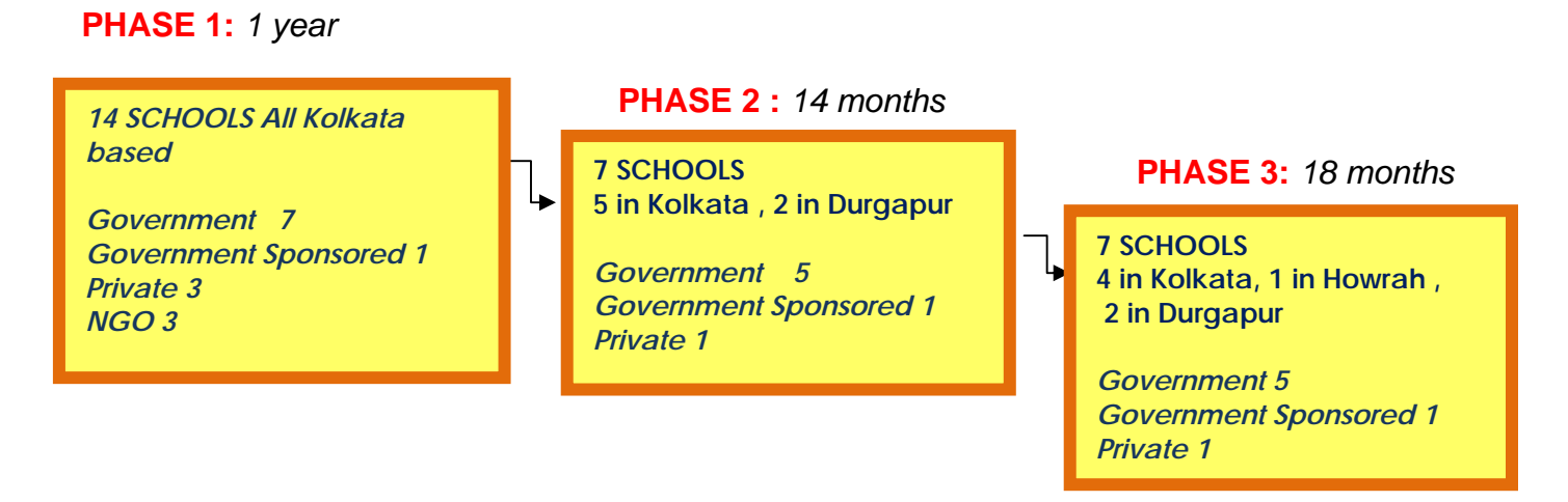
Chart 1: Flow chart showing the phases of the programme

In the third phase, one of the 5 Kolkata schools was reluctant to continue and so was replaced with a school from Howrah. At present there are 4 schools in Kolkata, 1 in Howrah and 2 in Durgapur involved in the project.