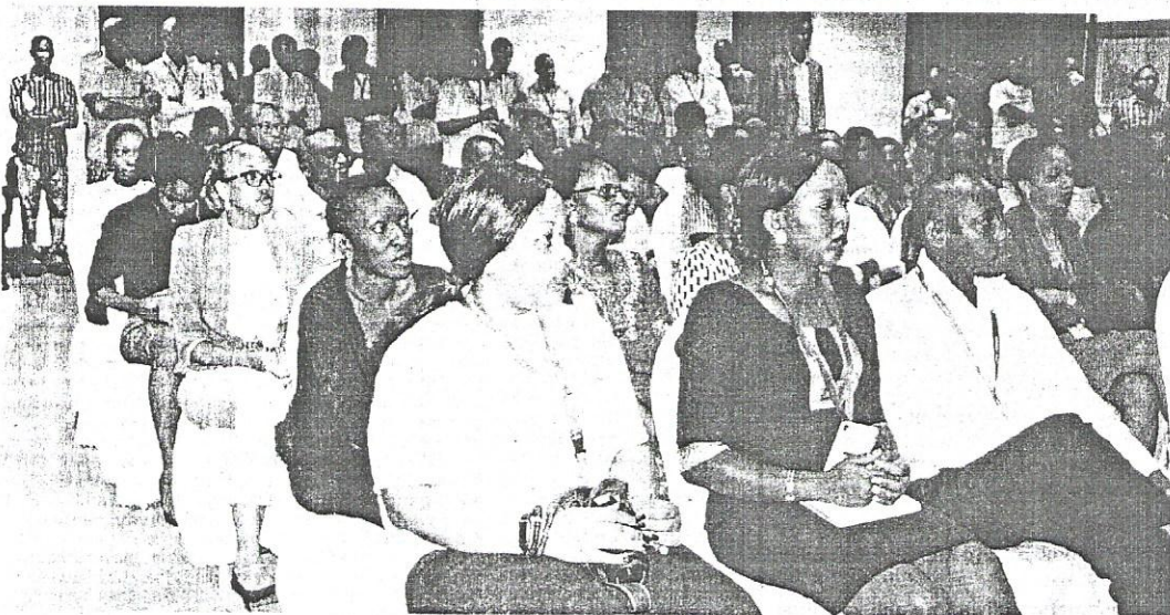
Baadhi ya wafanyakazi wa Kampuni ya Vodacom wakifuatilia mada kuhusiana na usalama wakati wa semina ya kuadhimisha Siku ya Usalama Kazini Duniani iliyofanyika kwenye ofisi za kampuni hiyo Mlimani City, Dar es Salaam juzi.

Aliyataja maradhi hayo kuwa ni Dondakoo, Surua, Polio, Kifua Kikuu, Kifaduro, Pepopunda, Homa ya ini, homa ya uti wa mgongo, kichomi na kuhara.