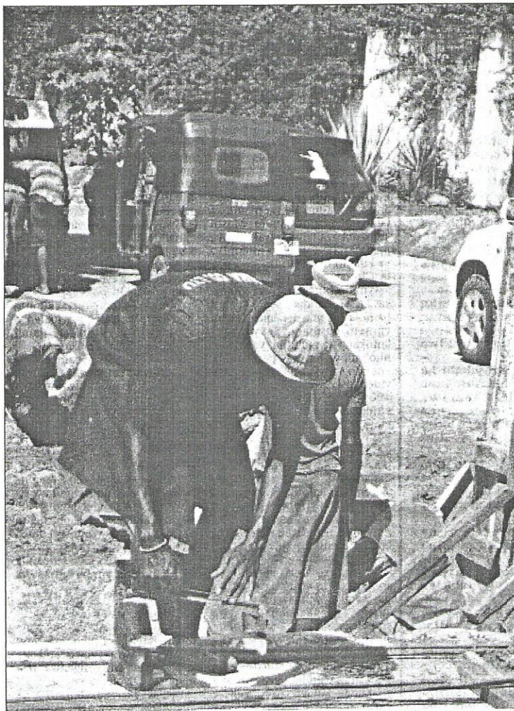
Mafundi ujenzi wa Kampuni ya Estim wakijonga mtaro wa barabara ya Morocco-Mwenge Dar es Salaam jana, inayopanuliwa kwa fedha sh. bilioni nne ambazo zilikuwa zitumike kwa ajili ya sherehe ya Uhuru iliyofutwa na Rais Dk. John Magufuli mwaka jana.