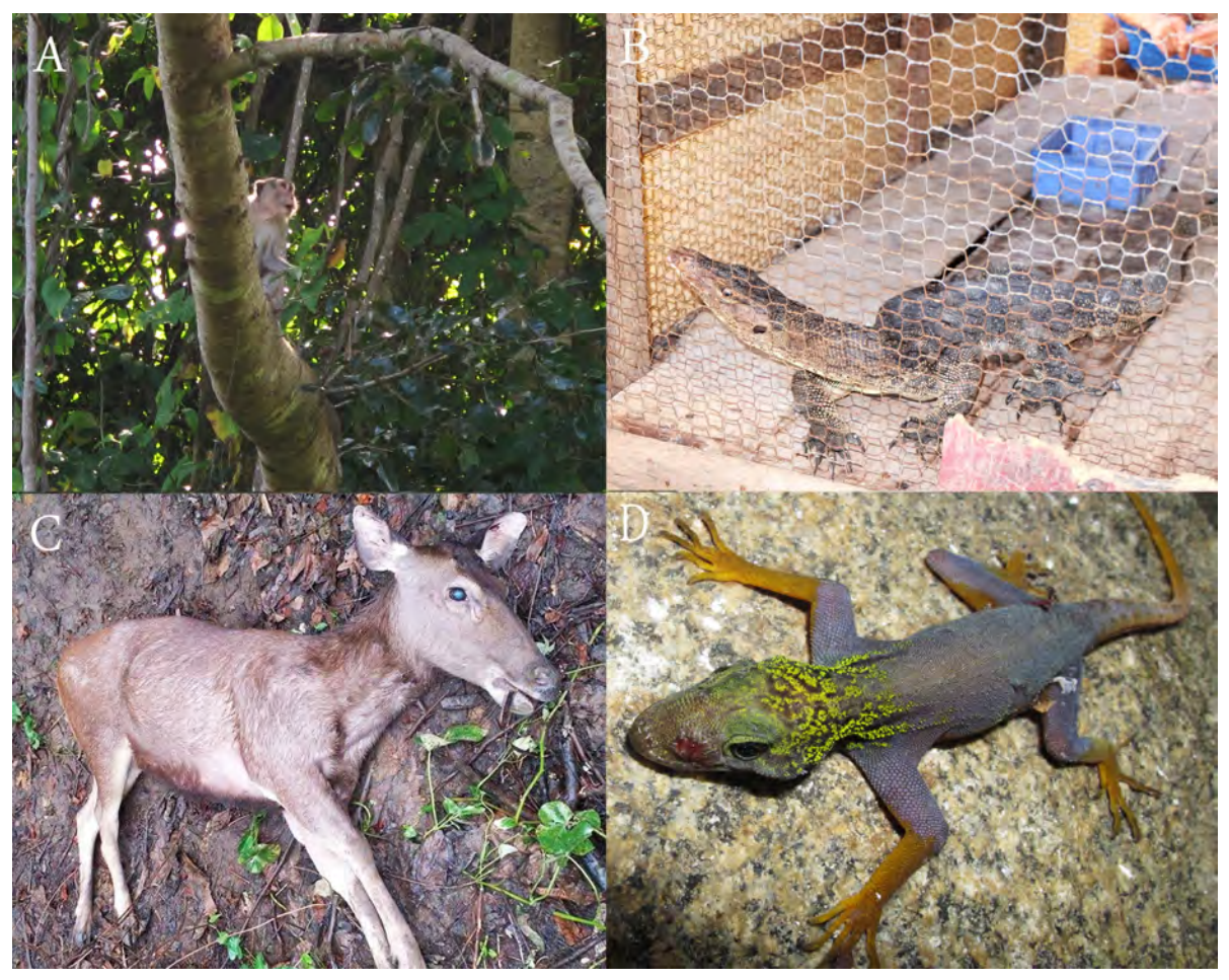
Fig. 5. A. Introduced macaque on Hon Khoai Island; B. Trapped Water Monitor Lizard for consumption; C. Deer killed by blasting of granite outcrops; D. Naturally occurring but injured C. psychedelica.

The present population estimation suggests a stable and actively reproducing population of C. psychedelica at least on Hon Khoai Island. While densities of the species at untouched sites were found to generally have increased from wet to dry season, we observed a decrease of the individual number in the areas, which were most strongly affected by habitat degradation. We assume that the current habitat destruction as well as the planned development of ecotourism will probably interfere with C. psychedelica natural populations, because the species was found to flee hastily in response to the presence of humans. Touristic activities and the presence of humans were already found to negatively affect other range restricted lizards such as Shinisaurus crocodilurus or Goniurosaurus species in northern Vietnam (Ngo et al. 2016; van Schingen et al. 2015). Regarding the small size of Hon Khoai Island, the availability of remaining alternative sites for C. psychedelica is limited. Since the species was only discovered in 2010, long-term population data is lacking and long-term consequences of habitat alteration are not yet investigated in detail.