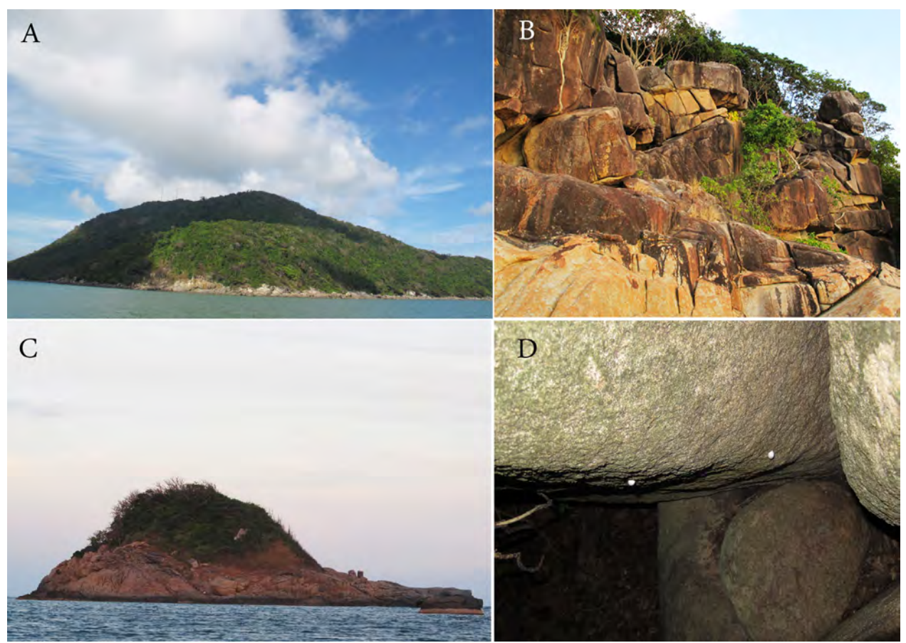
Fig. 1. Habitat of Cnemaspis psychedelica . A. Hon Khoai Island; B. Microhabitat on Hon Khoai; C. Hon Tuong Island; D. Deposited eggs on Hon Tuong Island.

Basic knowledge on the current population status of C. psychedelica, its ecology and potential threats are still lacking, as it is the case for most lizard species in the region. To better understand the threat level of a species, population size estimations provide essential baseline information and are thus crucial for wildlife management strategies and the assessment of the conservation status of populations and species (Ngo et al. 2016; Reed et al. 2003; Traill et al. 2007). The present study aims to provide the first assessment of the population size of C. psy chedelica as well as an evaluation of potential threats, in particular human impacts, in order to assess its conservation status and develop adequate conservation strategies. We further investigated seasonal variation in population size and structure by conducting field surveys both during the wet and dry seasons. In addition, we surveyed another, smaller offshore island in proximity to Hon Khoai to investigate potential occurrence of the species to assess its distribution range.