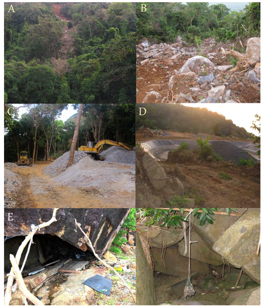
Fig. 4. Potential threats to Cnemaspis psychedelica . A. Erosion caused by opening of new ways; B. Forest opening and blasting of granite karst formations; C. Building of new roads; D. Building of artificial ponds to store freshwater; E. Camp of a fisherman living on the island; F. Trap for Monitor lizards.

to the island is generally prohibited (e.g., Altherr 2014; Auliya et al. 2016; Nguyen et al. 2015).