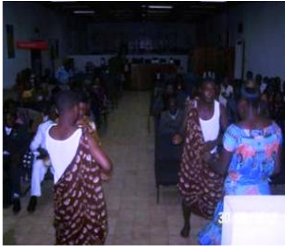
A YOUTH DRAMA GROUP AT FILM LAUNCHING

The launching was presided over by a representative of the Regional Governor but without financial support. The Regional Delegate of Forestry and Wildlife for the North West sent a representative with financial support.