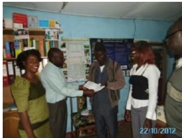
MINFOF AND PROJECT OFFICIALS WITH GRANTEE