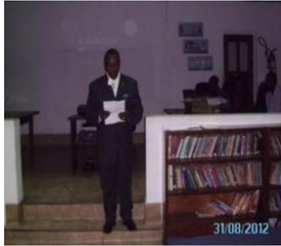
GOV'T REP. AT FILM LAUNCHING