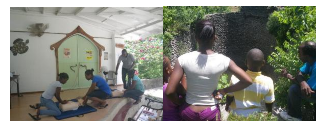
July 23, 2011 - First Aid class July 24, 2011 - Island Tour, the Ningo well (historical site)

The trainees who successfully pass the test will receive a Nature Guide certificate signed by Kido Foundation and the Carriacou Board of Tourism.