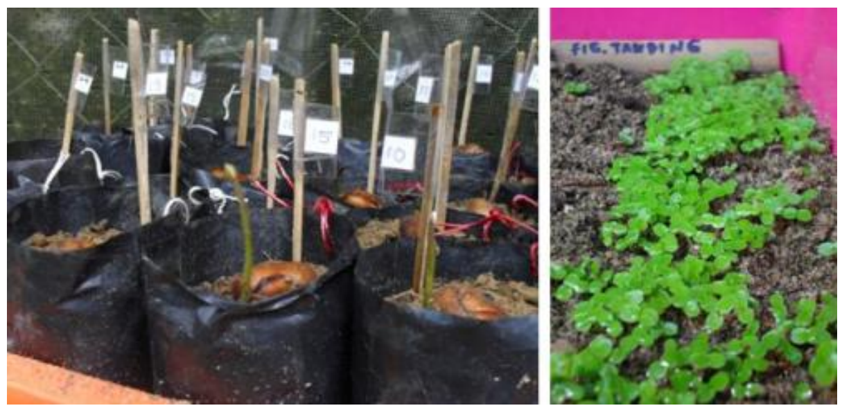
Figure 3. Germinations of Polyalthia spp. (left) and Ficus spp. (right) in the nursery

The germination experiment was implemented for Polyalthia spp . Seven planting sites were selected to represent habitat degradations and at each planting site five seeds were planted inside the fence and five were spread on the ground without "protection". The first result indicates that all seeds in all planting site germinate within 10-14 days after planting.