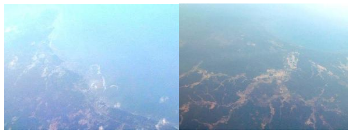
Figure 32 & 33. Aerial photo of Bangka Island from the air (North Bangka/left and South Bangka/right).