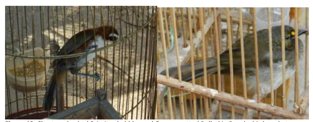
Figure 40. Chestnus-backed Scimitar-babbler and Orang-spotted Bulbul in Bangka bird market.