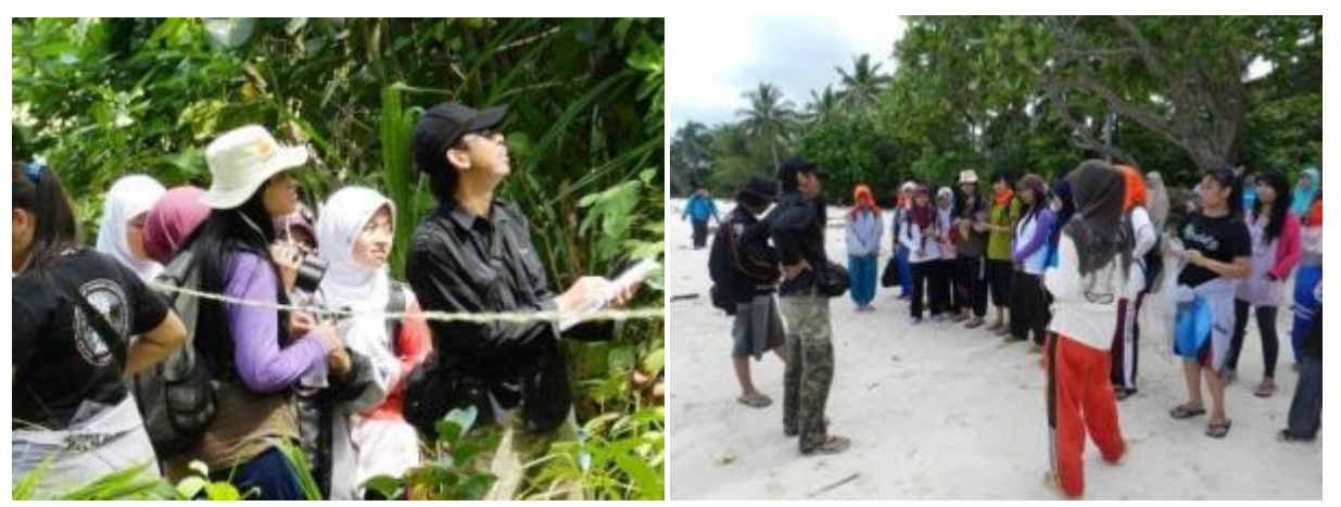
Figure 6 & 7. A introduction to the bird & wildlife of Bangka island was conducted to the students from Department of Biology Sriwijaya University.