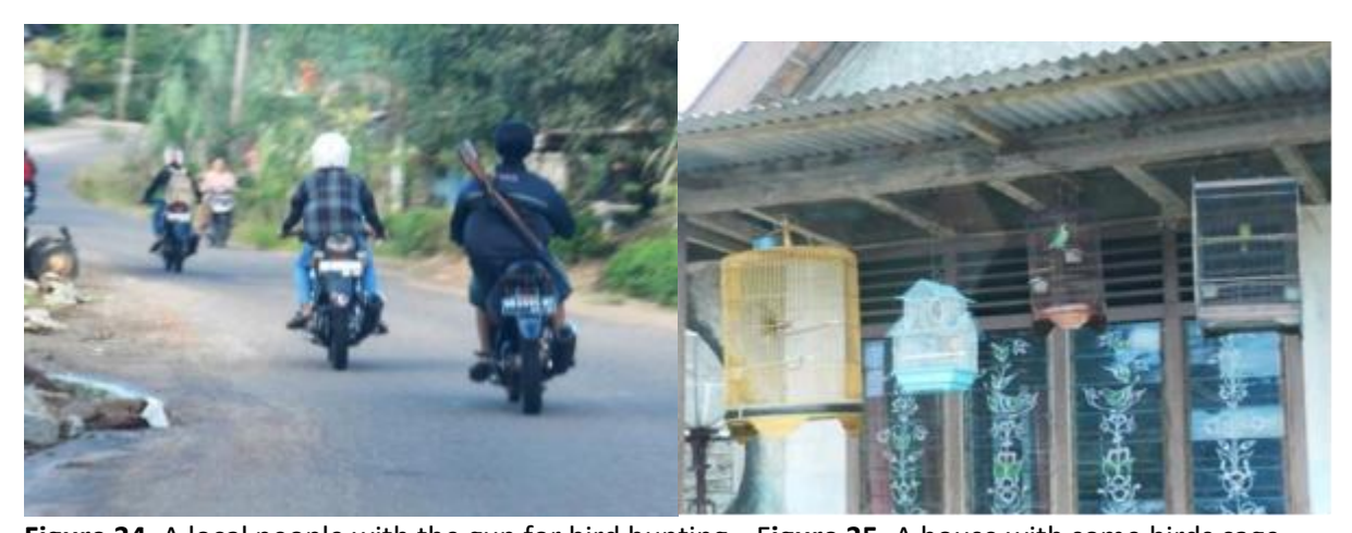
Figure 34. A local people with the gun for bird hunting. Figure 35. A house with some birds cage.