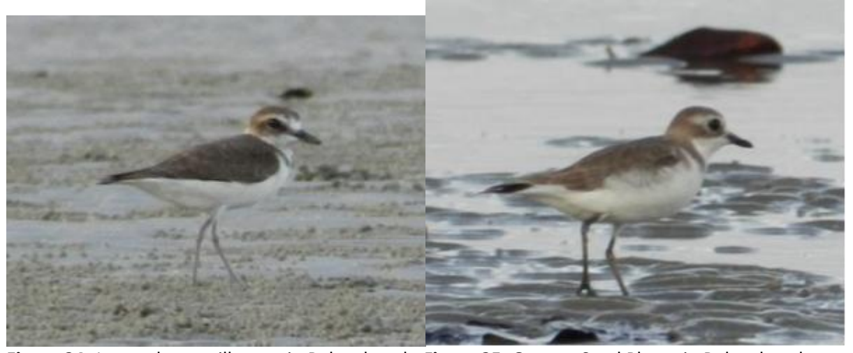
Figure 24. Javan plover still occur in Pukan beach. Figure 25. Greater Sand Plover in Pukan beach.