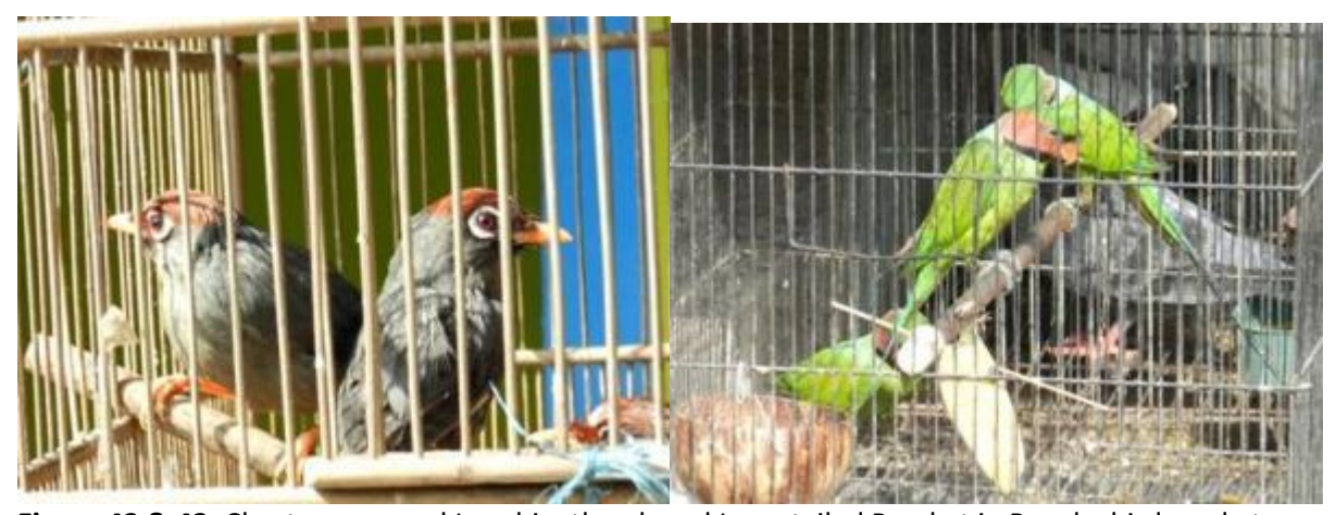
Figure 42 & 43. Chestnus-capped Laughingthrush and Long-tailed Paraket in Bangka bird market.