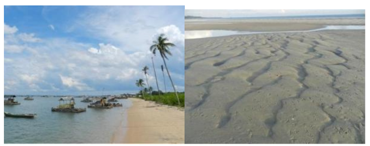
Figure 12. Beach near Permis hill/mountain. Figure 13. Shorebird track and sandy beach in Sandai