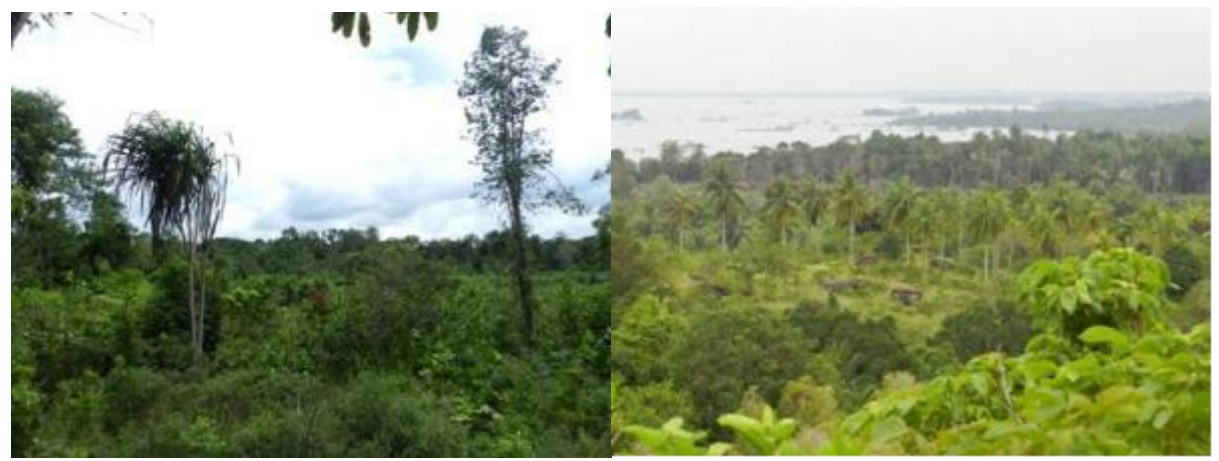
Figure 18. Other secondary forest (heath forest) in Penganak. Figure 19. A landscape in Tanjung Limau/Limau bay.