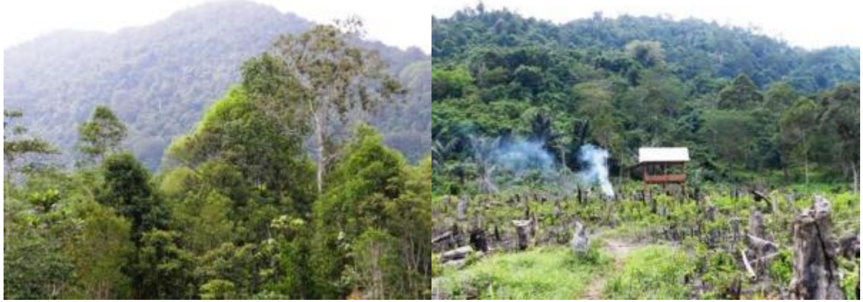
Figure 10 & 11. Forest in Permis mountain/hill and land clearing conducted by local people around here.