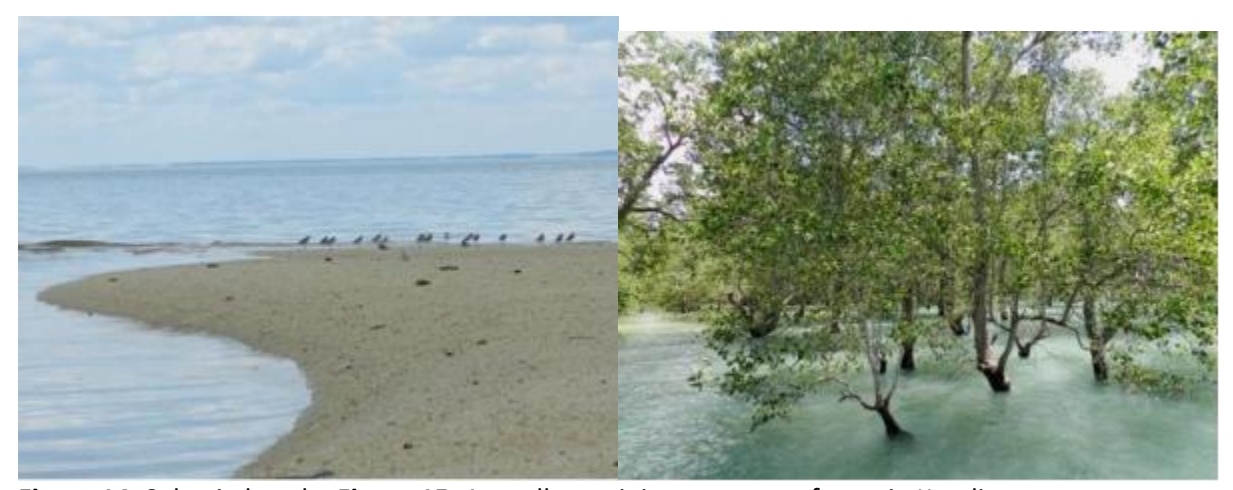
Figure 14. Sebagin beach. Figure 15. A small remaining mangrove forest in Kundi