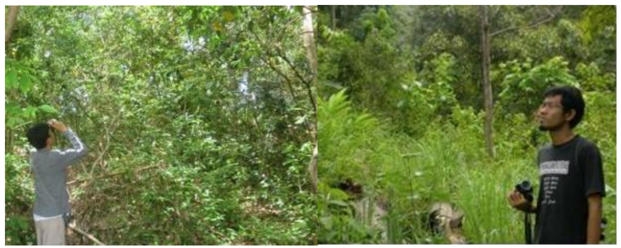
Figure 3. Fadly Takari searching bird in secondary forest near Rambat beach. Figure 4. The applicant searching bird in Permis mountain/hill.

13 = Sadai (S 03^{\circ}00'19.6'' E 106^{\circ}44'20.6'' )