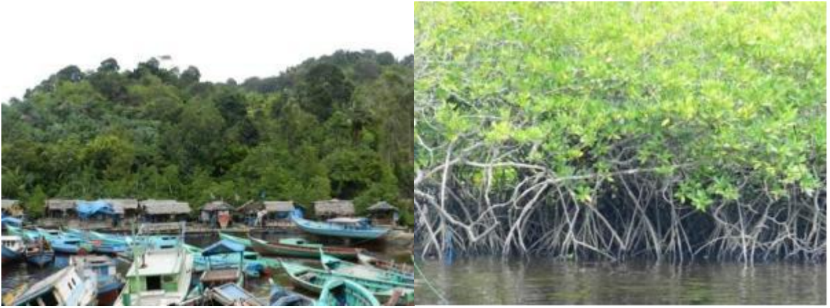
Figure 20. Mangrove forest combine with hilly forest in Limau Bay. Figure 21. A small remaining mangrove forest in Limau Bay