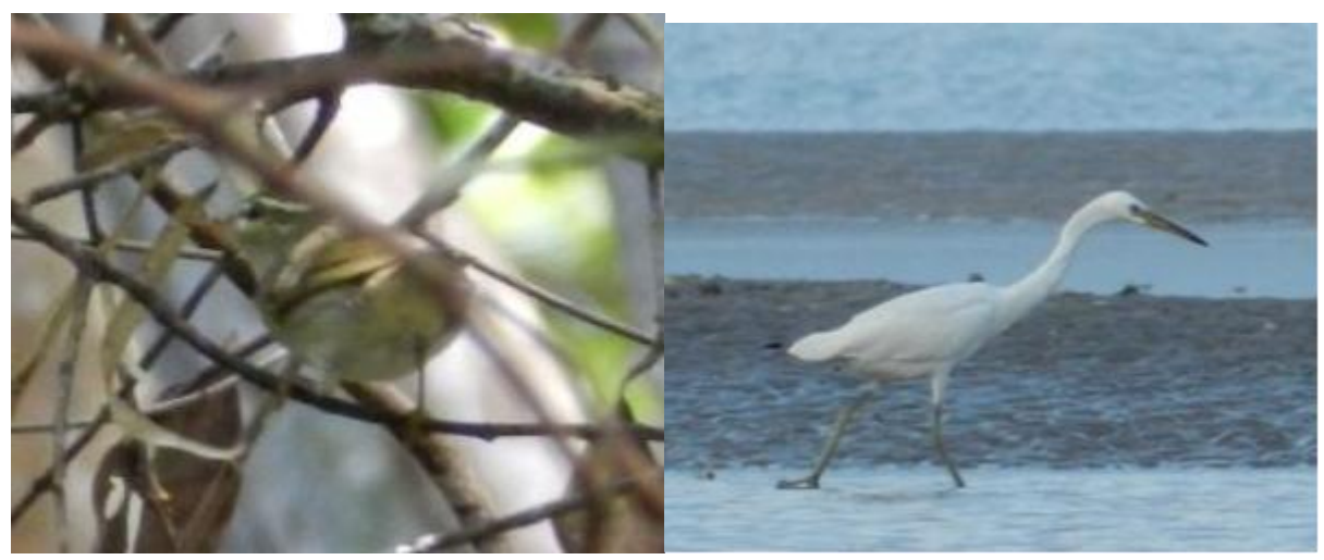
Figure 22. Arctic warbler in secondary forest near Kundi beach. Figure 23. A Chinese Egret in Sadai beach.