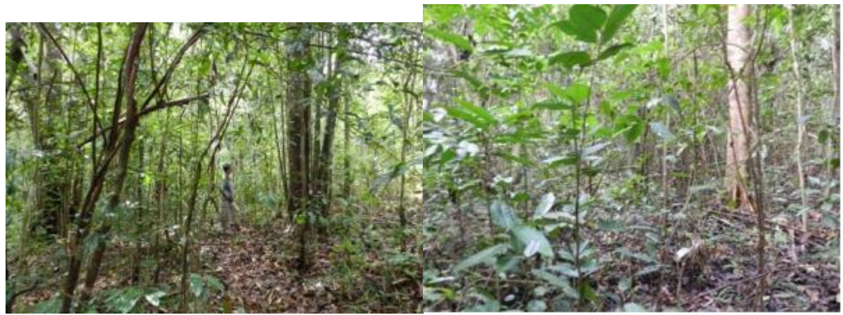
Figure 16. Secondary forest (heath forest) near Kundi beach. Figure 17. A secondary forest in Pantai Penganak.