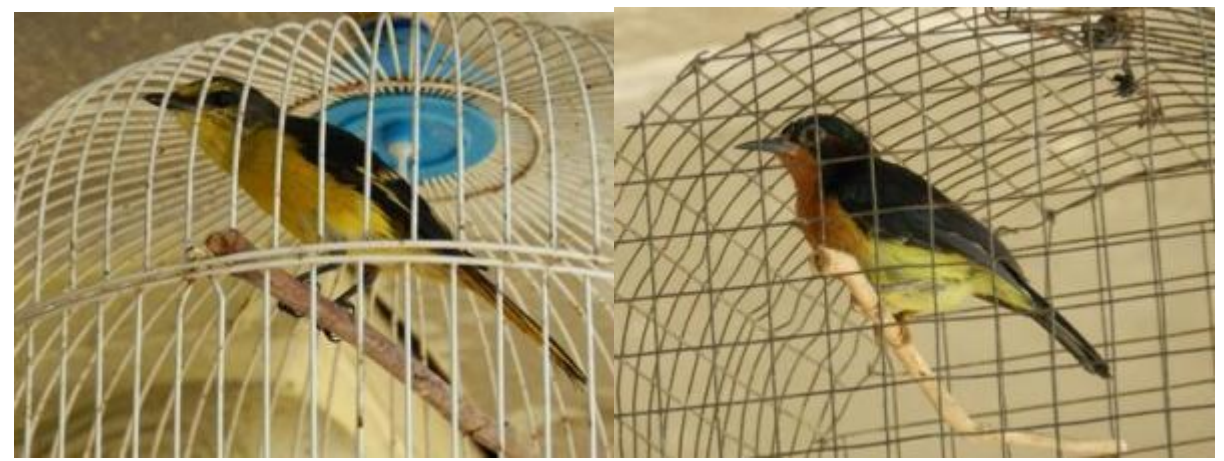
Figure 38 & 39. Minivet and sunbird in localpeople house as bird cage.