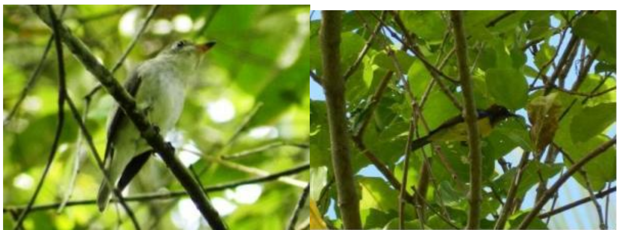
Figure 30. Arctic warbler in secondary forest near Kundi beach. Figure 31. Brown-throated Sunbird in Penganak Beach.