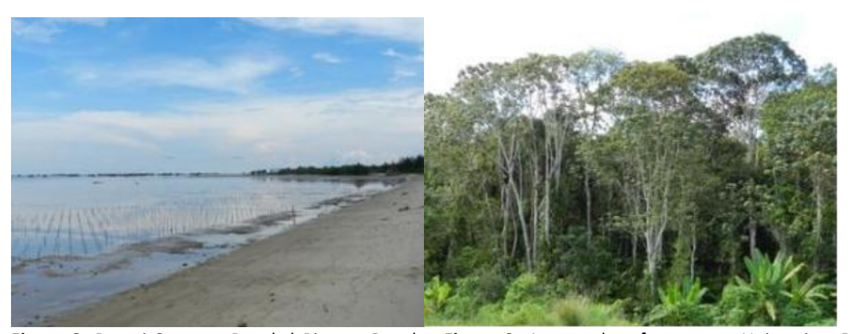
Figure 8. Pantai Sampur, Pangkal Pinang, Bangka. Figure 9. A secondary forest near Universitas Bangka Belitung