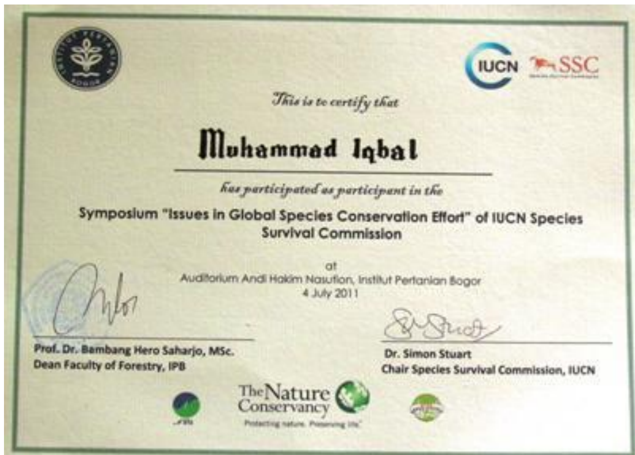
Figure 1. Certify for attendance.