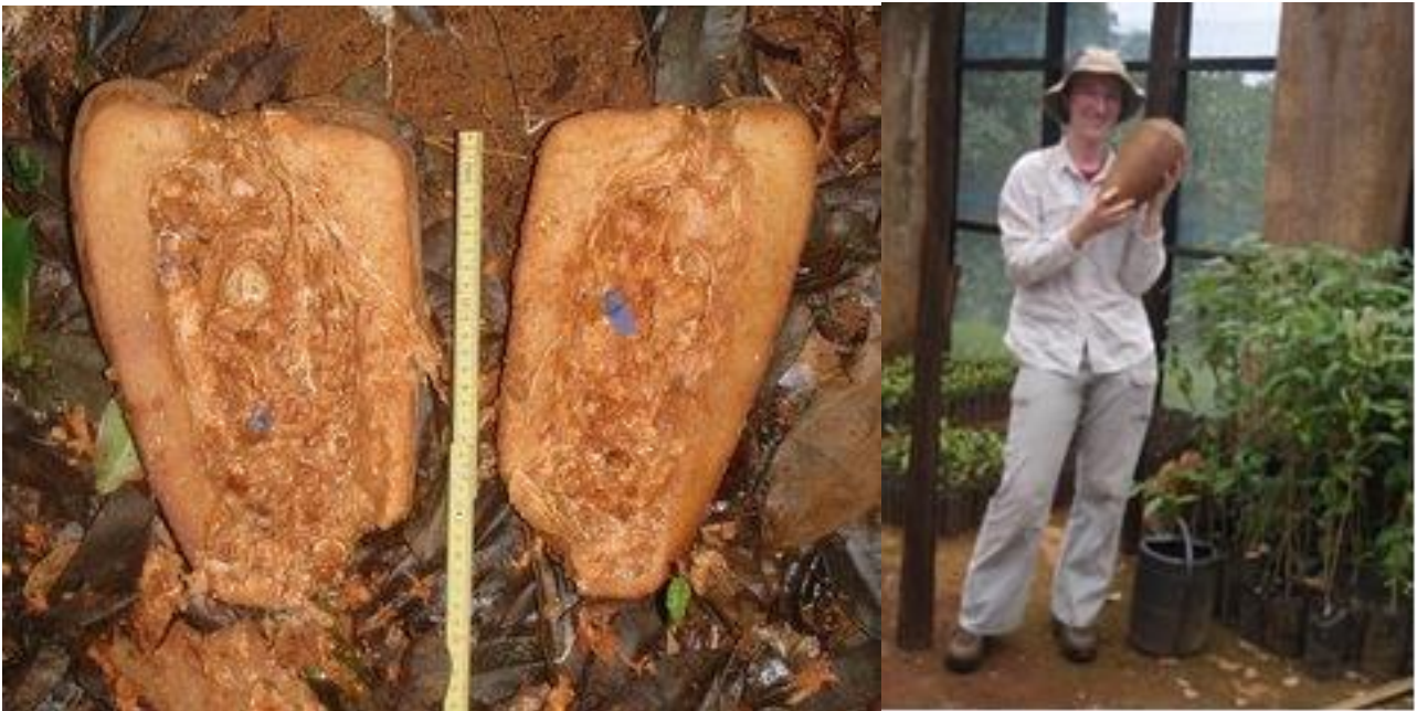
Left: Allanblackia fruit cut open with a machete and seeds removed. Right: Carrie holding an Allanblackia fruit.

In March and April 2011, we conducted two rounds of seed removal experiments with 1152 tagged seeds total. Seeds were attached to a thread bobbin with wire and marked with a fluorescent yellow tag. One camera in each plot photographed animal dispersers. As suspected, the most common disperser is the giant pouched rat, Cricetomys gambianus . The fate of remaining seeds is being checked once per month.