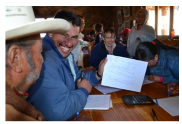
Rural Tourism Business workshop (working in teams).