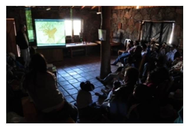
Cave Paintings Interpretation workshop.