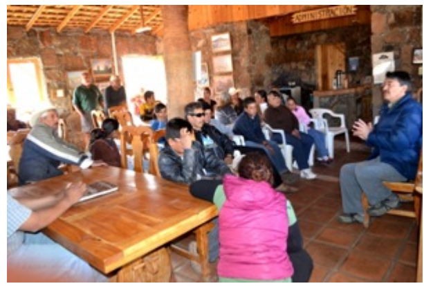
Environmental Interpretation workshop (low impact tourism).