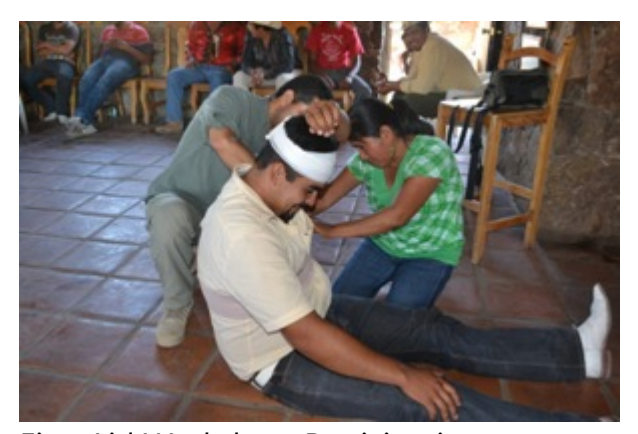
First Aid Workshop. Participating.