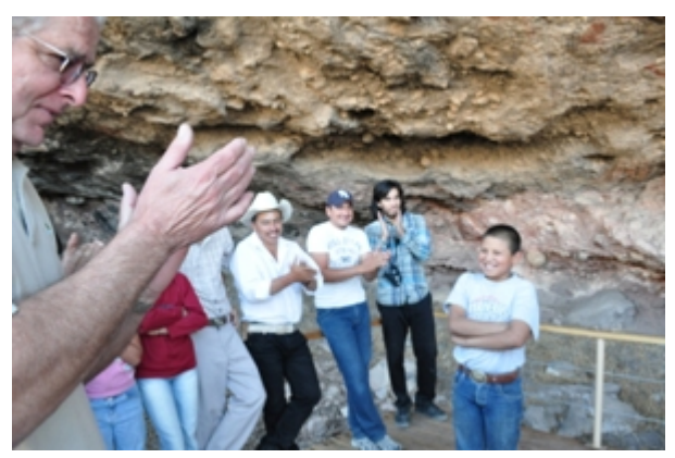
Cave Paintings Interpretation workshop. Practical.