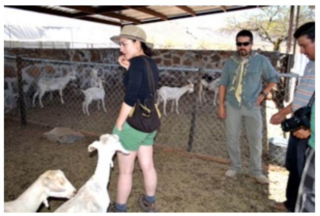
Activities in the ranch tour (feeding goats).