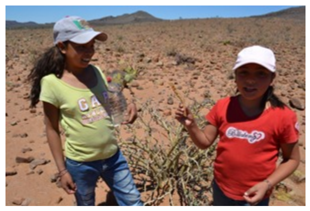
Training children to become interpretive environmental guides.