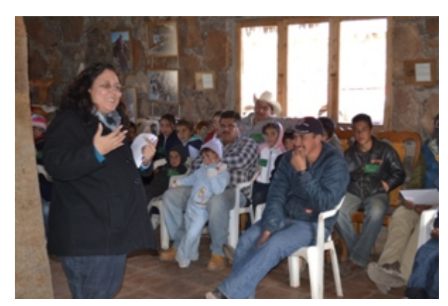
Rural Tourism Business workshop.