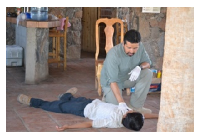
First Aid Workshop.