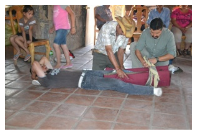
First Aid Workshop. Participating.