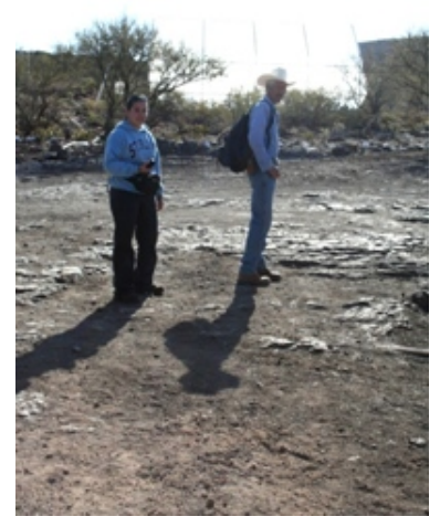
Ranch tour signaling.