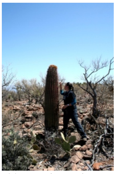
Visitors at the ranch tour.