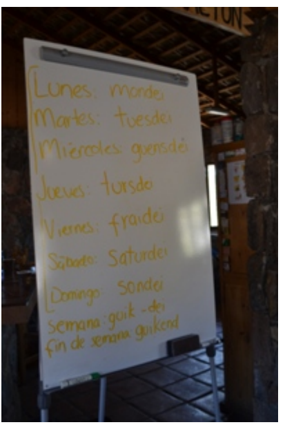
White board. English lesson (no grammar, phonetics only).