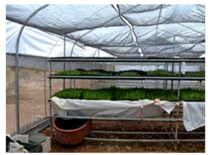
New greenhouse vegetable for human consumption.