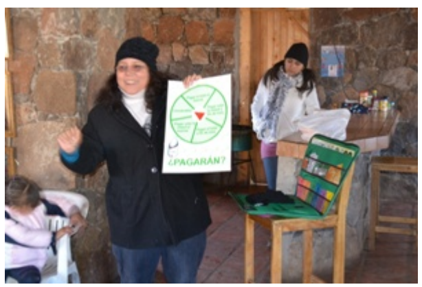
Rural Tourism Business workshop. Financial issues.