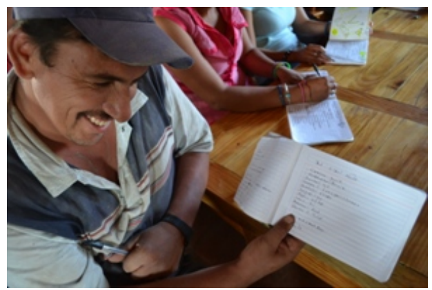
Participant of the Basic English workshop.